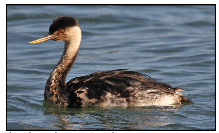
Oiled Clark's Grebe; photo by Glen Tepke.

• Birds: To estimate total mortality, the trustees conducted field studies to examine how long bird carcasses persist on the beach, how difficult it is to find them, and how many are deposited naturally. The number of birds estimated killed (below) is approximately 2.3 times higher than the number collected live and dead. The estimates are: