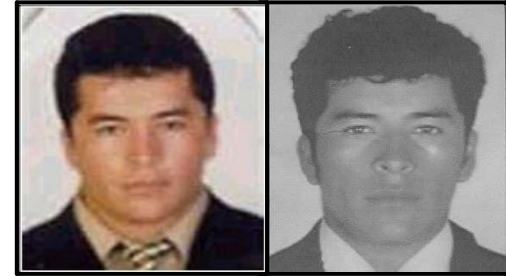
Heriberto LAZCANO LAZCANO "LAZCA" or "Z-3" or "Verdugo"

Mexico's Office of the Attorney General is offering nearly $2.4 million (30,000,000 pesos), per individual, for information leading to the arrest of top Gulf Cartel and Los Zetas members.