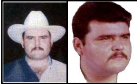
Jorge Eduardo COSTILLA SANCHEZ "El Coss"

DOB: 08/01/1971 Alt. DOB: 01/06/1971, 06/01/1971, 06/06/1971 Voter: CSSNJR71010628H801