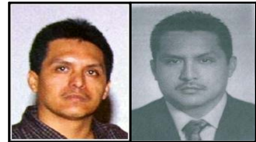
Miguel Angel TREVINO MORALES "L-40" or "Cuarenta"

DOB: 12/25/1974 Alt DOB: 01/25/1974, 01/01/1970 CURP: LALH741225HHGZZR03