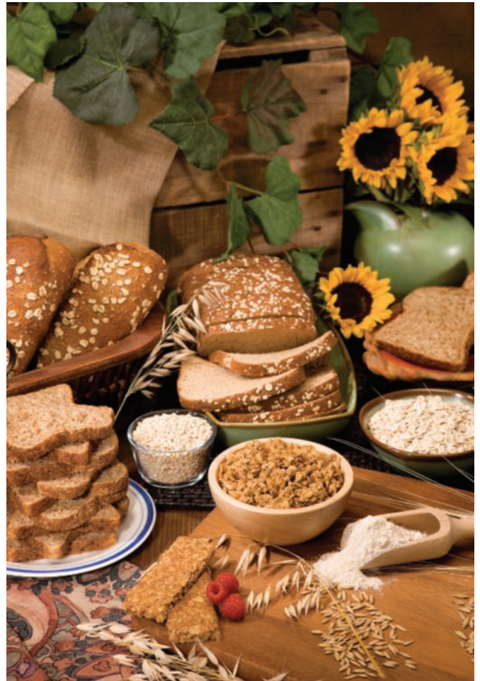
Left: The ARS Beltsville Human Nutrition Research Center in 2011 released data tables that summarize not only nutrients gained from foods and beverages consumed—but for the first time also from supplements consumed. Right: Based on USDA Food Patterns, depending on age range and calorie needs, people should be eating between 1.5 ounces to 5 ounces of whole grains daily. But most age groups are eating less than 2 ounces of whole grains per day, according to ARS survey data analyses.