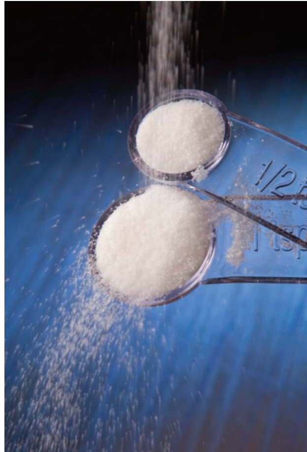
PEGGY GREB (D2452-1)

The survey data show that people consume the equivalent of more than 1.5 teaspoons of salt—nearly 3,430 milligrams of sodium—each day. Most U.S. adults consume on average more than twice the maximum daily sodium intake recommended.