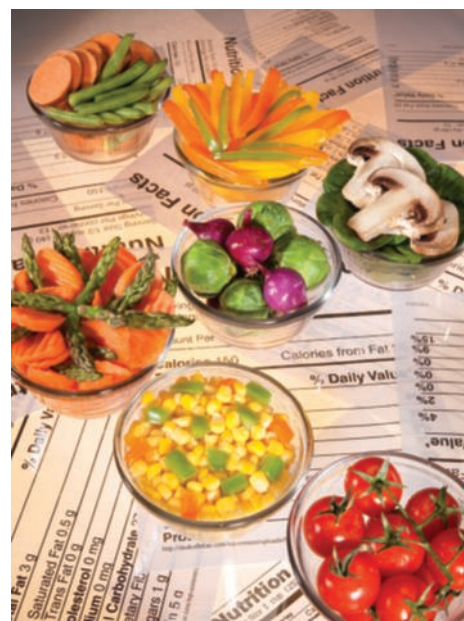
PEGGY GREB (D2454-1)

Cutting-edge research on what we eat as a population and what nutrients are in those foods is critical for ensuring that people have the opportunity to plan diets that support optimal health.