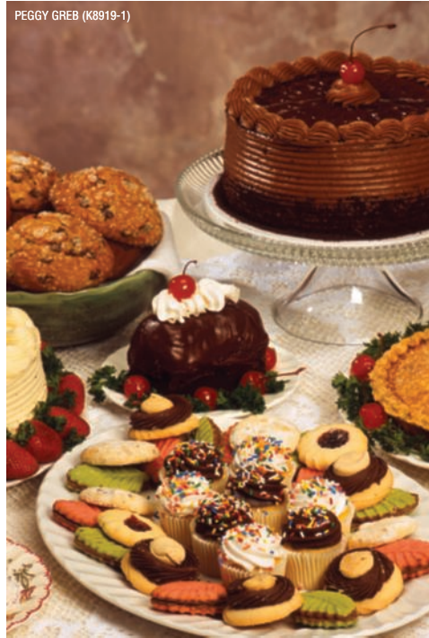
PEGGY GREB (K8919-1)

Based on national survey data analyses, grain-based desserts account for a greater proportion of daily calories than any other food group in people age 2 and older.