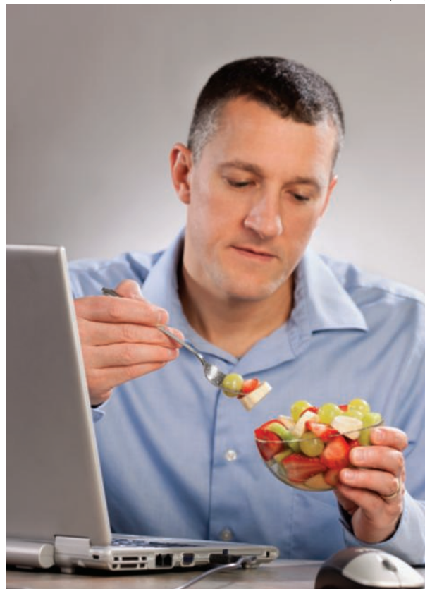
Men should get 2 to 2.5 servings of fruit daily, but most men are getting only slightly over 1 serving a day, according to survey data analyses.

For example, women are recommended to get 1.5 to 2 servings of fruit daily, but most women are getting only 1 serving of fruit a day, and nearly half that comes at