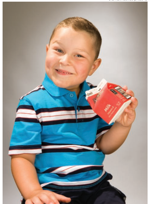
Milk contains very little natural vitamin D, so it is almost always fortified.