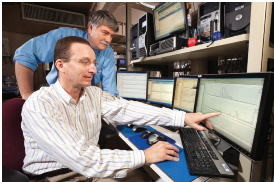
STEPHEN AUSMUS (D2438-1)

Chemists Craig Byrdwell (foreground) and James Harnly, with the Beltsville Human Nutrition Research Center, review data from one of the liquid chromatography/mass spectrometry machines used in a process called “triple-parallel mass spectrometry.” They use this procedure to analyze the amount of vitamin D in milk, orange juice, and dietary supplements.