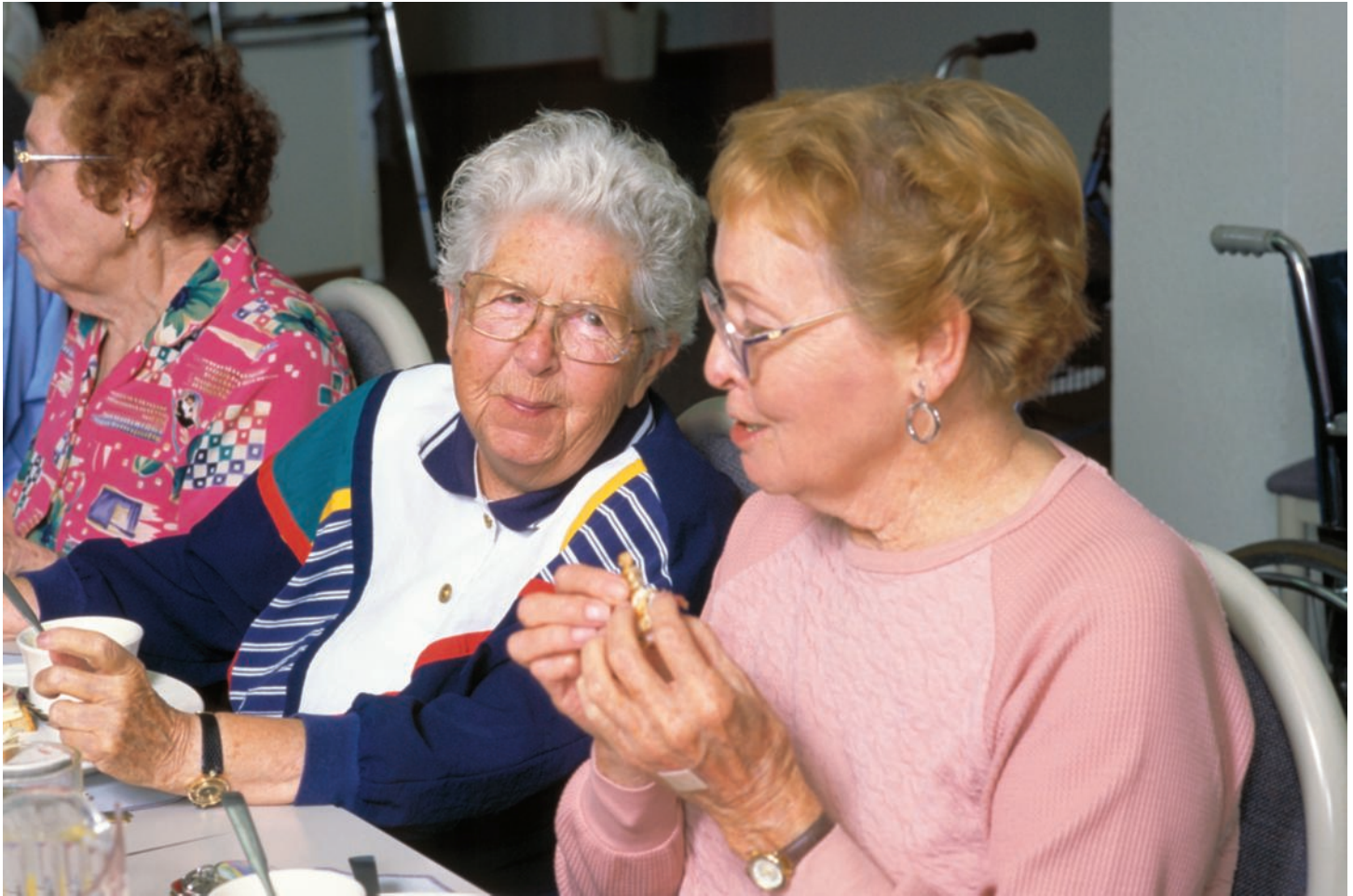
ARS survey data tables show that older people tend to take dietary supplements more often than younger people. Nearly 60 percent of women age 60 and older take a calcium supplement, but only 22 percent of women aged 20 to 39 take one.