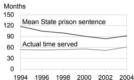
Mean State prison sentence and time served for violent felonies

Note: Estimates for time served in prison are based on the assumption that someone sentenced in a particular year would serve the fraction of the imposed sentence found among prisoners released that year. 2003 data were used to estimate time served in prison in 2004.