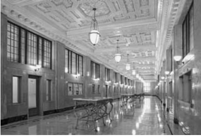
FIGURE 4 Good lighting depends on effective distribution of natural and electric light.

New guidelines recognize that good workspace lighting depends as much on effective light distribution as light output measured in foot candles and that excessive lighting can hamper productivity while consuming more energy than necessary. Uniform high-output “factory style” ambient lighting approaches formerly used to upgrade open area workspaces are no longer considered appropriate for most GSA properties. Variable lighting levels tailored to the specific tasks and design of a historic space can support preservation goals while improving workspace quality and comfort. Multiple lighting sources offer greater flexibility for addressing differing needs for ambient, task, safety, and accent lighting.