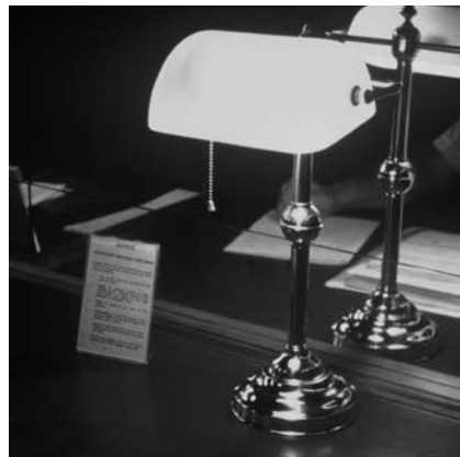
FIGURES 14-16 Traditional supplemental lighting such as desk lamps preserve the architectural dominance of historic chandeliers and place light where it is needed to perform work. Top (before restoration): Surface mounted fluorescent lighting compromises the reading room’s coffered ceiling and competes with the chandeliers. Middle and Bottom (after restoration): Reader-controlled desk lamps eliminate the need for high ambient light levels, enabling the ceiling to be restored to its original appearance.

When historic fixture modifications and task lighting cannot adequately address ambient lighting needs, explore additional light-supplementing options that will not compete with historic lights. In historically significant spaces, supplementing chandeliers, pendant lights or other ceiling mounted lights with wall mounted sconces, uplights mounted on fur-