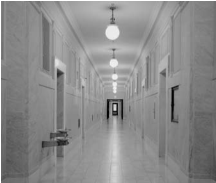
FIGURE 6 Replacing incandescent lamps with compact fluorescent lamps is one of the simplest ways to reduce energy use in spaces containing historic light fixtures. Installing energy efficient ballasts and lamps provides even greater long-term operational cost savings.

The simplest and least expensive method of reducing energy use in spaces containing historic light fixtures with incandescent lamps concealed by translucent or opaque globes, shades, or lenses, is to replace the incandescent lamps with compact fluorescent lamps. Changing to a fluorescent source with color temperature as close as possible to that of the incandescent lighting (2700 Kelvin) will help to ensure against lighting color changes that may have a negative impact on the appearance of historic finishes and features.