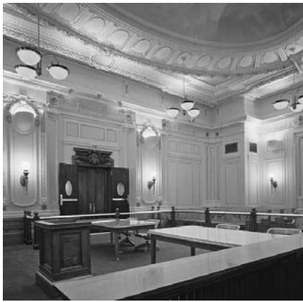
FIGURE 18 Quietly designed sconces maintain visual focus on the historic chandeliers and decorative finishes embellishing this historic courtroom.

rather than beaming light down on corridor occupants, subtly maintaining the visual dominance of the skylit atrium the corridors overlook.