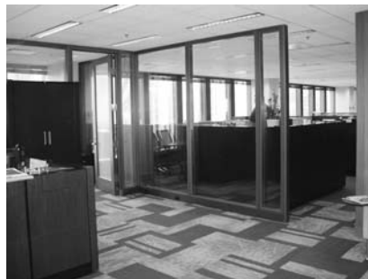
FIGURE 12 Low partitions and glazed partitions allow light to penetrate into workspaces.

Low or glazed partitions allow light to penetrate into open office workspaces for building occupants not seated along exterior walls. Studies show that employees will generally choose a space offering generous daylight over a space offering privacy with no daylight, underscoring the importance of workspace design features that allow light to penetrate as far as possible into the building floorplate.