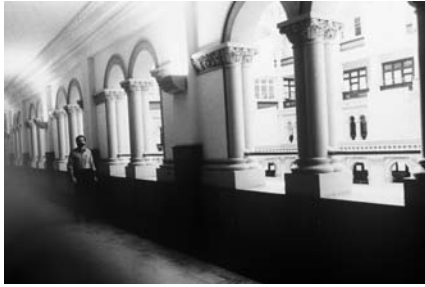
FIGURE 17 Contemporary sconce lights illuminate walls and ceilings in corridors where daylight originally served as the principal light source for this 19th-century post office. The opaque shades of the sconces reflect light against the walls of the corridor,

niture, or freestanding lamps is preferable to installing additional ceiling fixtures.