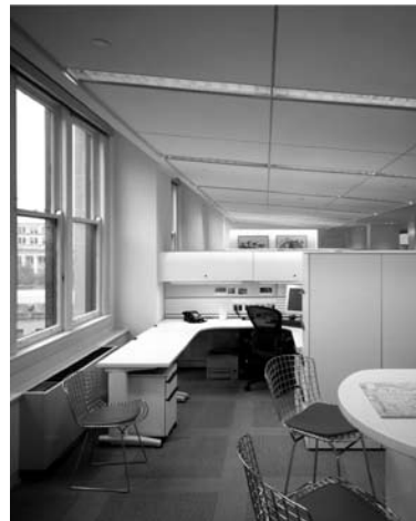
FIGURE 11 Preserve window opening clearance by recessing suspended ceilings from windows or configuring ceilings to slope upward toward the window head or step down toward the building interior.

Since the amount of light penetrating a room is limited by the height of the opening, it is important that windows are not partially blocked by suspended ceilings, wall partitions and other alterations. Design suspended ceilings to be recessed from window openings by creating pockets or soffits around windows or configuring ceilings to slope upward toward the head of the window or step down toward the corridor to accommodate ductwork and other building systems.