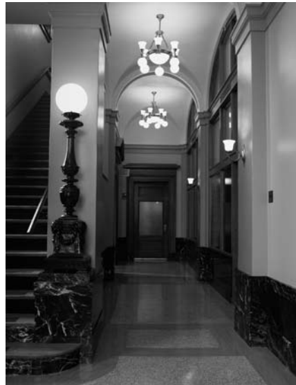
FIGURE 3 Interior upgrade projects often provide opportunities to restore compromised spaces and make a historic building more marketable.

GSA's Office of Federal High Performance Green Buildings provides guidance on sustainable design, energy efficiency, resource conservation, and workspace quality for GSA repair and alteration projects of all scales. There are many ways that energy reduction and workspace needs can be met while preserving character-defining historic light fixtures and making the most of inherent energy conserving features in historic buildings. Lighting upgrades and interior renovation projects often provide opportunities to remove inappropriate alterations and restore compromised spaces to improve tenant satisfaction and make a historic building more marketable.