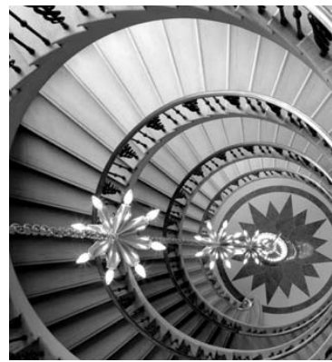
FIGURE 7 Installing high-efficiency incandescent (HEI) lamps in historic exposed bulb fixtures reduces energy use by 50-75 percent with no impact on the appearance of the fixture.

Historic fixtures that do not provide adequate lighting may sometimes be modified to include additional light sources, such as light emitting diodes (LEDs) or fiber optics, where modifications can be done inconspicuously and lamp temperatures (color) will be compatible.