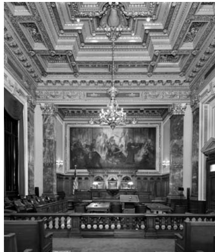
FIGURE 2 Variable light levels and multiple light sources contribute to the historic character and elegance of this early 20th century courtroom.

When fluorescent lighting emerged as the principal approach for achieving uniformly high light levels, daylighting features such as glazed transoms and partitions were often removed or obscured. Skylights were commonly covered over as an emergency measure for public safety during World War II blackouts or during subsequent roof repairs to eliminate maintenance. At some historic buildings, original light fixtures have been replaced with inappropriate lighting that introduces glare from lamps rendering cool hues unsympathetic with the building's historic character.