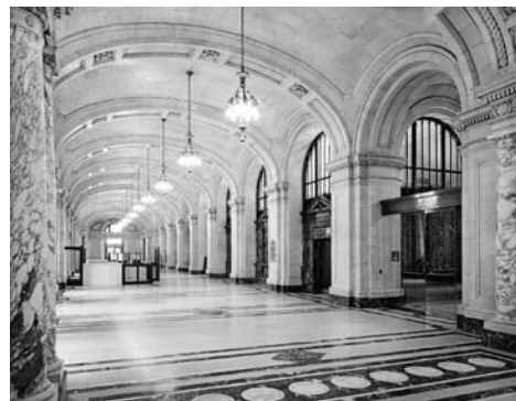
FIGURE 1 Electric lighting thoughtfully supplements daylight in this historic lobby.

When historic drawings for restoring historic chandeliers and other decorative fixtures or replicating historic fixtures are not available in GSA's BPP, HSR or the Public Buildings records of the National Archives and Records Administration, work with GSA's RHPO to identify similar buildings that may serve as a source for comparable examples to be used as a basis for restoration. Existing historic fixtures may be retrofitted with compact fluorescent lamps, reflectors, light emitting diode (LED) and other light sources to increase light output and energy efficiency. High efficiency incandescent lamps appropriate for use in historic light fixtures featuring exposed incandescent bulbs are currently in development and expected to be available in 2010. When specifying replica fixtures, consult the GSA's RHPO and electrical engineering or sustainability experts to determine the most cost effective, preservation-appropriate lamp or lamp/ballast combination for meeting GSA performance, energy conservation and preservation goals in new period fixtures.