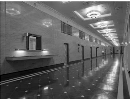
FIGURE 5 GSA Building Preservation Plans identify spaces of architectural importance and character-defining features, including historic light fixtures, to be preserved.

Every successful GSA historic building project begins with review of the specific building’s Building Preservation Plan (BPP) or Historic Structure Report (HSR) to ensure that GSA teams involved in developing project requirements and overseeing design and execution are well informed on the building’s preservation goals at the earliest stages of project planning and design. The BPP or HSR identifies spaces of architectural importance and character-defining features, such as historic light fixtures, to be preserved. BPPs and HSRs also outline restoration goals for altered public spaces, sometimes including detail drawings of original fixtures as a basis for replication.