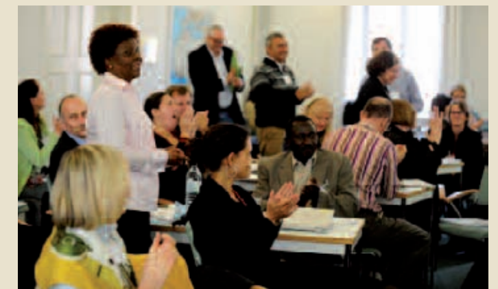
Plenary in Parker Hall