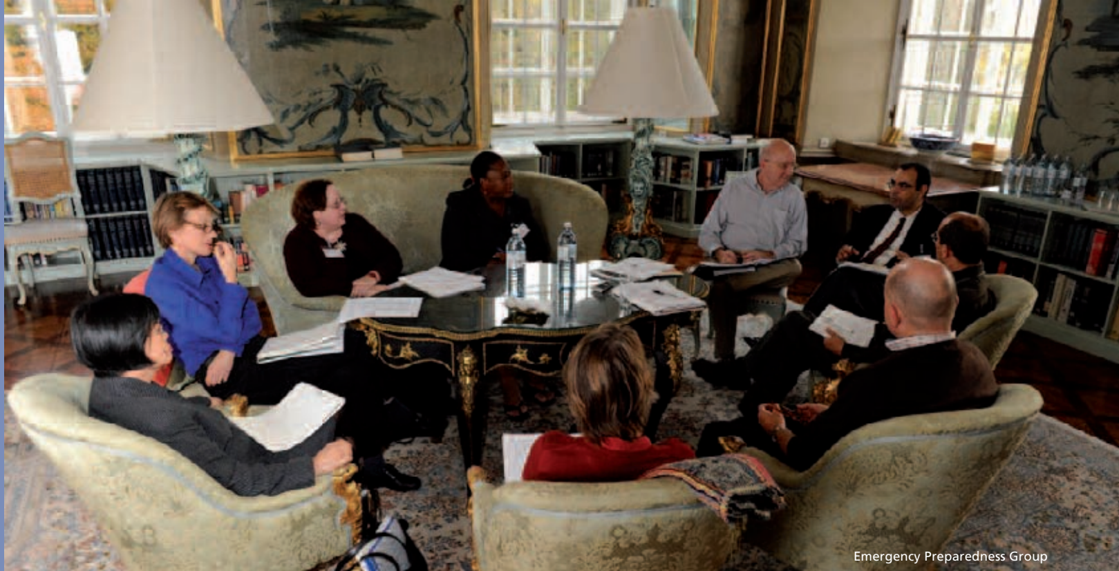
Emergency Preparedness Group