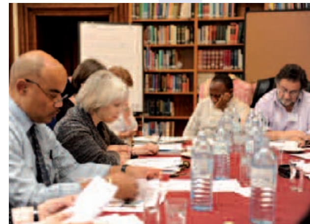
Working Group 4