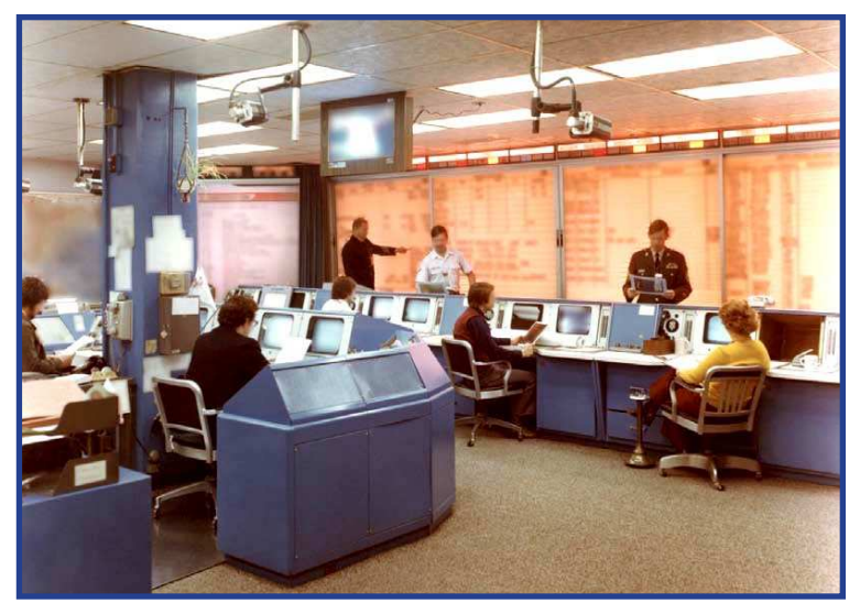
Operations Watch Area after modernization with improved computer screen displays