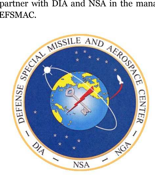
The 2010 DEFSMAC seal showing the DIA, NSA, and NGA partnership

2010 — The National Geospatial-Intelligence Agency (NGA) became a full partner with DIA and NSA in the management and operation of DEFSMAC.