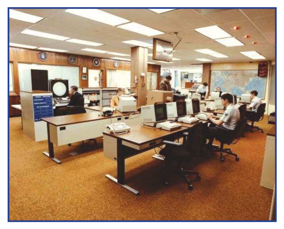
1983 Operations Watch Area before the upgrade with single computer-connected terminals and minimum display capability

By the late 1970s, the need for computers to support the operations center and the analysts/reporters had grown dramatically. The many new missile and satellite intelligence targets followed by DEFSMAC required expansion of operations, reporting, and computer support areas. Other upgrades to the communications complex needed to be planned as well.