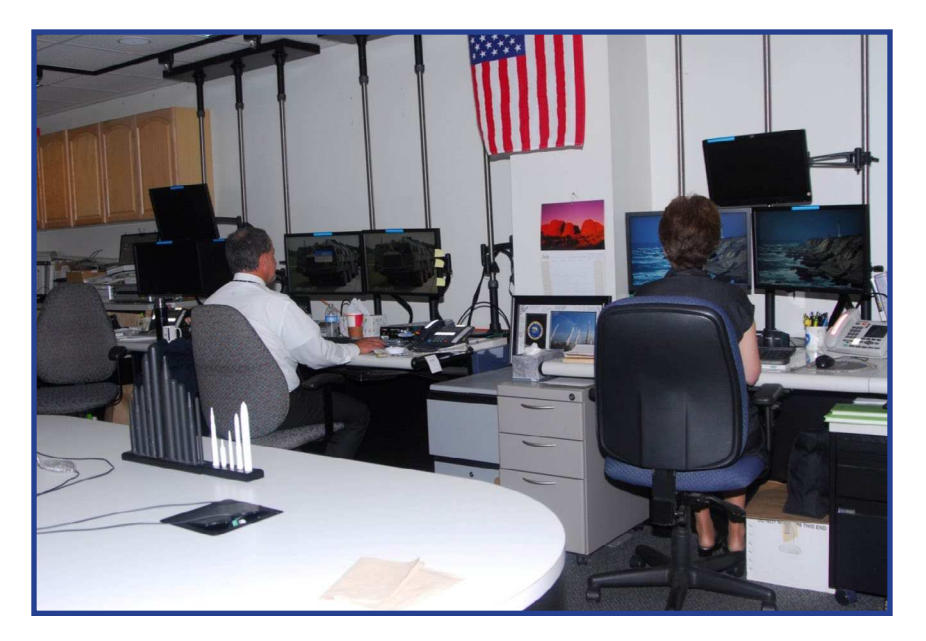
Two analysts at their workstations in the missile analysis and reporting work area, after the 2005 upgrade to the workspaces.

A new challenge was the addition to the DEFSMAC mission of providing early information on missile and space launches by foreign nations involved in a crisis or war. The Center addressed these challenges by developing techniques to integrate intelligence source information from collection assets and to provide more timely analysis and reporting to the DEFSMAC intelligence customers.