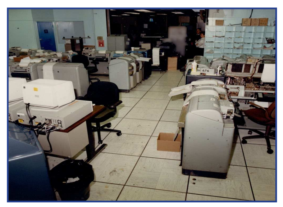
The 1970s-1980s teletype communications to collection locations and customers, still with paper-based operations

The Operations Directorate (OP) coordinated current data collection operations (twenty-four hours a day), collection resources management, and target development.