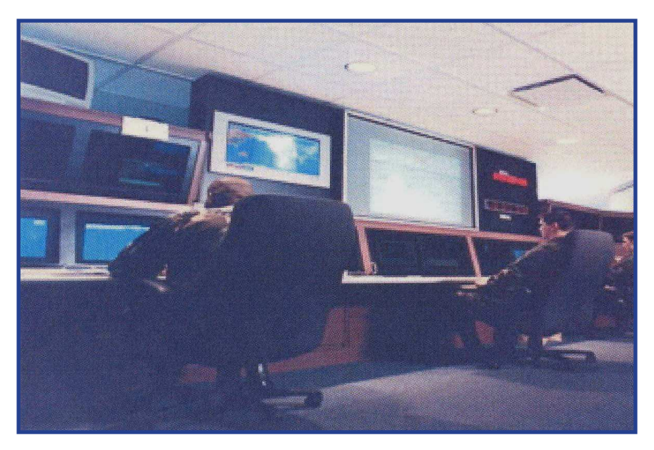
The new location included modern computer console workstations, equipment, and extensive interactive databases and computer resources.

By the early 1990s DEFSMAC had once again outgrown the space and facilities available to operate the Center. A completely new facility was planned and implemented with the added constraint of maintaining the twenty-four-hour-a-day operation without any disruption in capability. The modernization of the Center was completed and put into operation, still within NSA facilities at Fort George G. Meade. The upgrade also provided increased and improved worldwide communications access to collectors and customers as well as major additions to the computer and database assets essential to managing the operation.