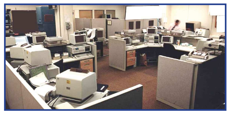
Communications work area in later 1980s with all teletype machines replaced with just computer "PCs"