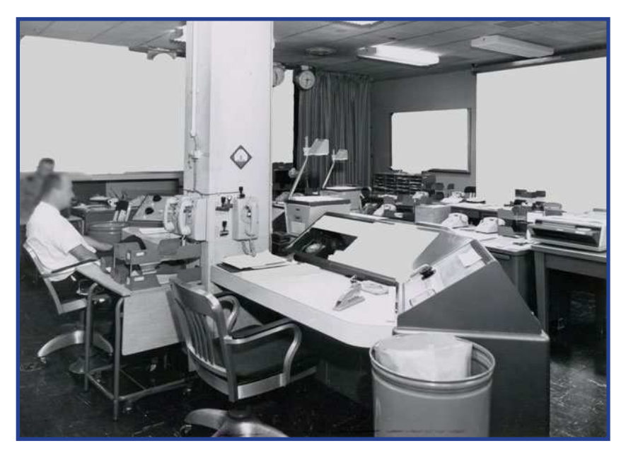
The 24-hour-a-day Watch Operations Area at NSA in June of 1964

After DEFSMAC was established by the April 1964 DoD Directive, NSA moved quickly to find a suitable location at the NSA complex at Fort George G. Meade, MD. The NSA SMAC operation was relocated, space was added for the DIA personnel who were assigned to DEFSMAC, and a communications area and a target location work area was designed into the new Center.