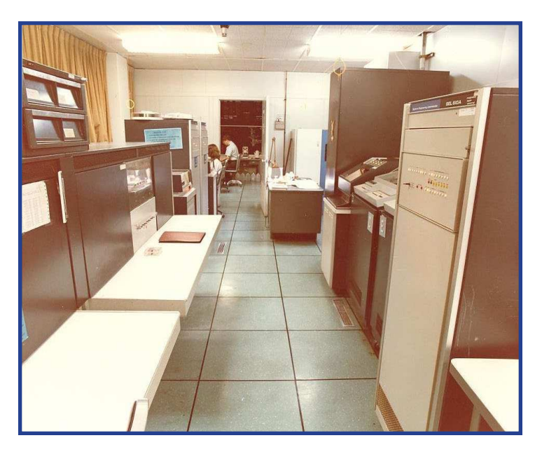
Computer support work area in the late 1970s. Several computer systems that directly supported DEFSMAC were located adjacent to the DEFSMAC operations and analytic work areas.

The Data Systems Development (SY) element provided computer system upgrades and supported current operations and intelligence reporting. SY also assisted other NSA elements as they developed new, or modified, computer systems to support DEFSMAC requirements.