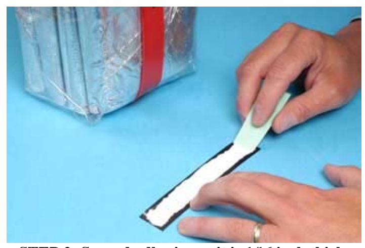
STEP 2: Spread adhesive so it is 1/16 inch thick.