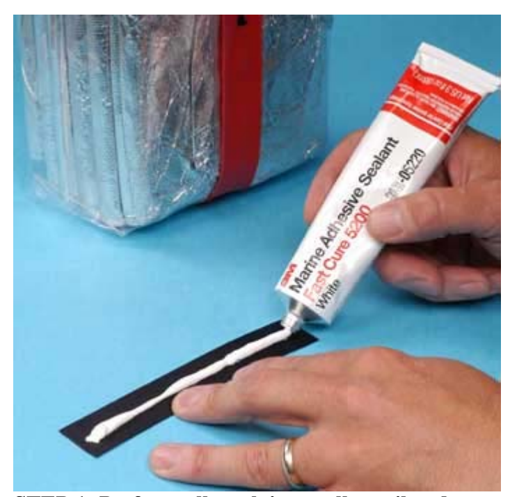
STEP 1: Perform all work in a well ventilated area. Cut the webbing to proper length with a heat knife or sear the ends with a match to prevent them from fraying. Apply a thin bead of adhesive to the nylon webbing.

The following photographs show a simple way to reinforce PVC shelter bags produced before June 2005.