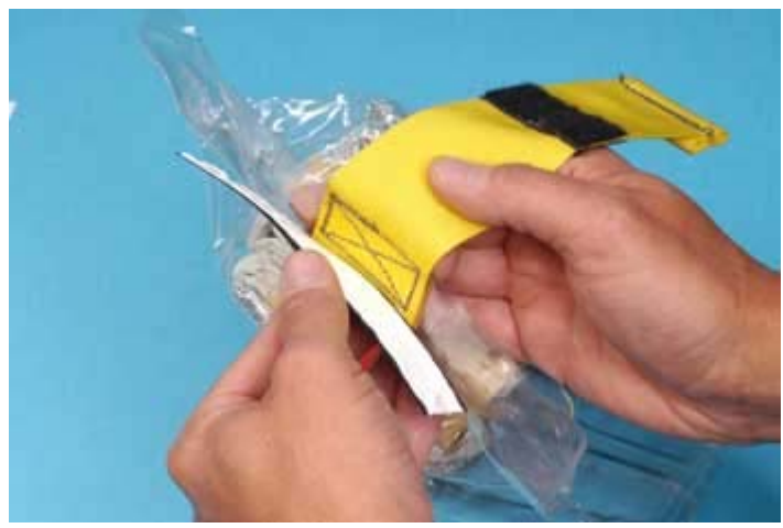
STEP 3: Apply the webbing to one side of the pull strap attachment area and smooth it in place. Repeat on the opposite side of the pull-strap attachment area.