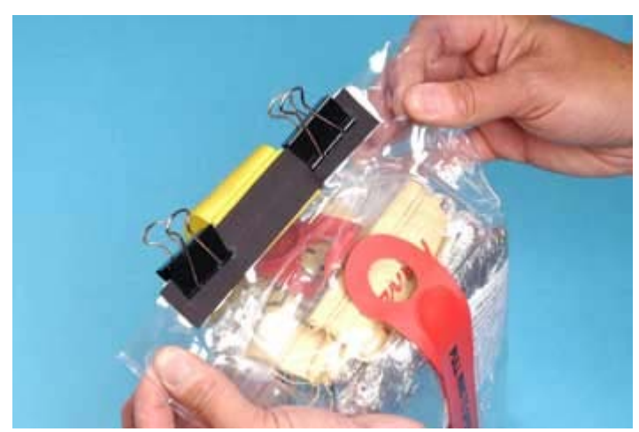
STEP 4: To ensure positive contact until the adhesive cures, use clothespins or paper binders to hold the webbing in place. The adhesive cures in 24 hours.

Question or comments regarding this information should be directed to Tony Petrilli, USDA Forest Service, MTDC, at 406 329-3965.