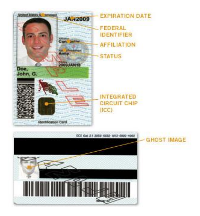
Figure 4. U.S. DoD/Uniformed Services ID Card

facilitate standardized, uniform access to DoD facilities, installations, and computer systems.