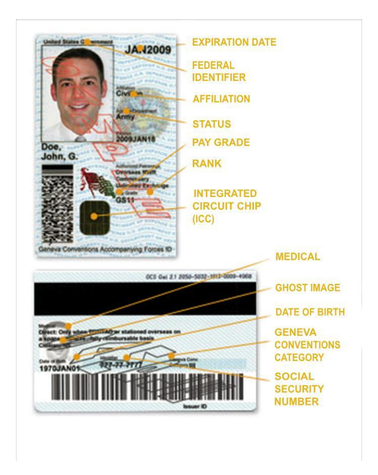
Figure 2. U.S. DoD/Uniformed Services Geneva Conventions ID Card for Civilians Accompanying the Armed Forces