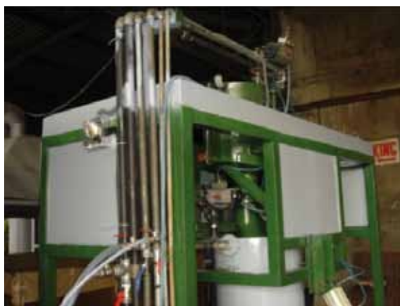
Locally designed and fabricated Box Foam Machine by Pamaque Nig. Ltd.

The Montreal Protocol funds were not spent on the development of the local brand. Apart from being easier to operate, the local product meets all Montreal Protocol requirements.