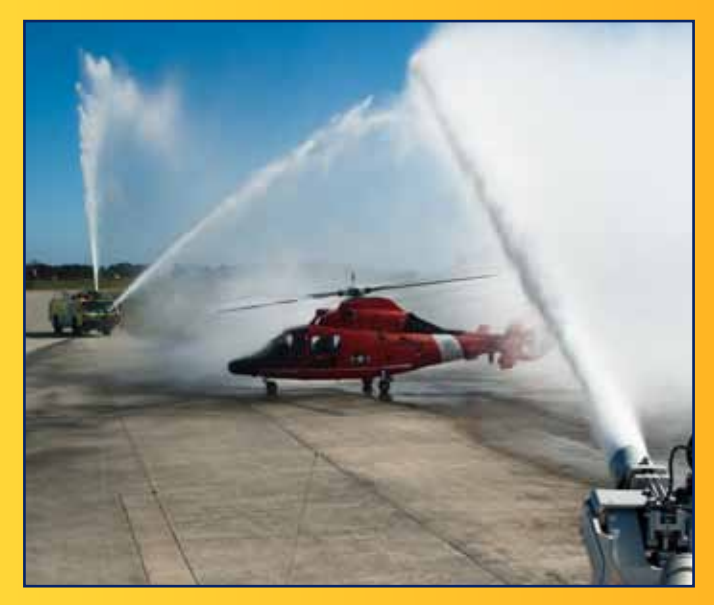
At a commemorative retirement ceremony, water trucks create a celebratory arch over the final HH-65C helicopter to be converted to an MH-65.

Helicopter Interdiction Tactical Squadron in Jacksonville, Fla., an armed helicopter squadron specializing in airborne use of force and drug interdiction missions.