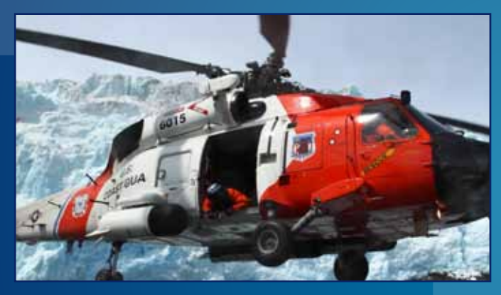
An upgraded MH-60T flies over Alaska, where it plays a critical role in helping the Coast Guard execute its missions in the vast geography of the frontier.

"If you look at the helicopter projects for both the H-60 and H-65, we call them conversion and sustainment projects. Not only are we adding capability that is immediately helpful for the aircrew flying it, but we are also enabling the Coast Guard to sustain that aircraft for much longer," Martin said. "And with fewer maintenance man-hours required and fewer parts removed for repair than was previously the case, it will allow us to keep the assets flying well into the 2020s."