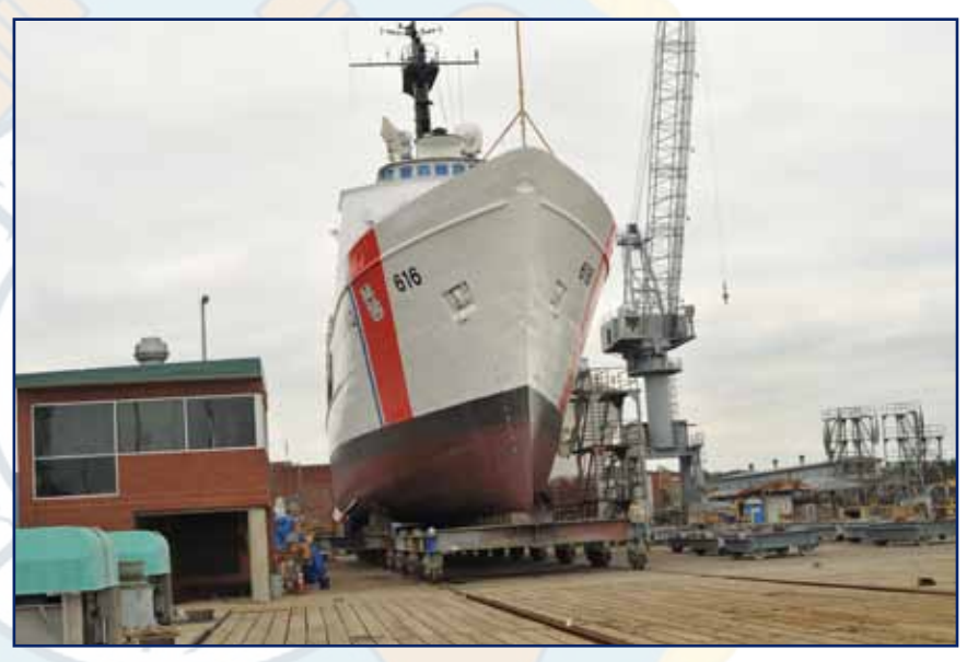
The Coast Guard Cutter Diligence, a 210-foot Medium Endurance Cutter, undergoes major refurbishment at the Coast Guard Yard in Baltimore as part of the Mission Effectiveness Project.

The important thing is that each chunk can only be spent on what Congress and the President authorize us to spend it on. We cannot move money between the different budget slices without going back and asking for the law to be changed.