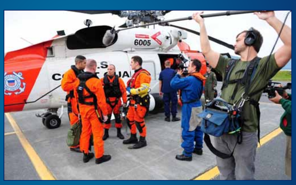
A TV crew from "Coast Guard Alaska" captures the conversation of an aircrew from Coast Guard Air Station Kodiak, Alaska, as they gather in front of one of the station's upgraded MH-60T helicopters.

"Filming aboard the helicopters, the Coast Guard and the helicopter crews specifically have been fantastic," Dingley said. "The helicopter has really been like a secondary