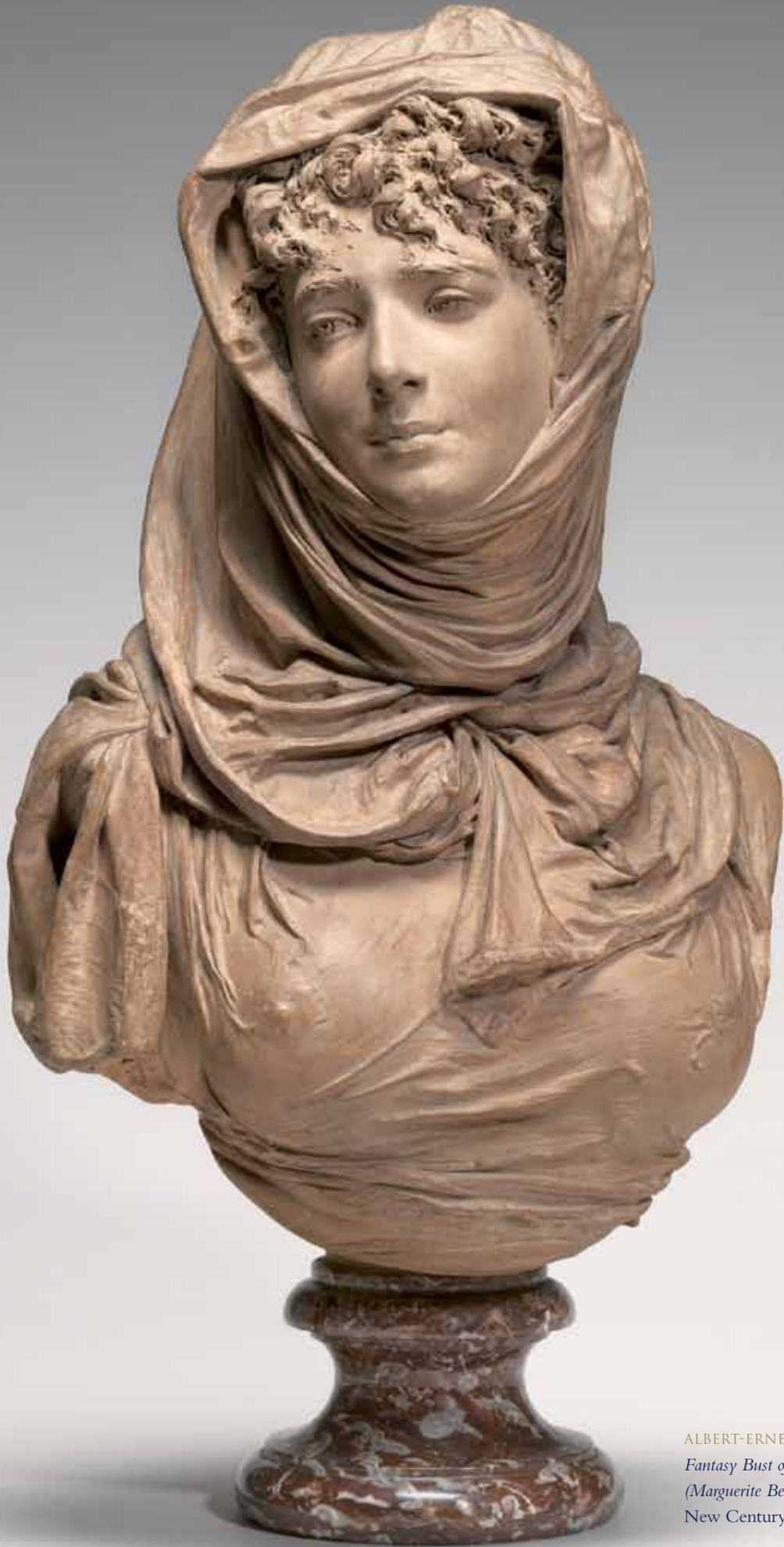
ALBERT-ERNEST CARRIER-BELLEUSE. Fantasy Bust of a Veiled Woman ( Marguerite Bellanger? ), New Century Fund