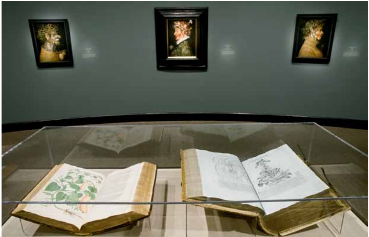
↓ AMERICAN MODERNISM: THE SHEIN COLLECTION

A fully illustrated catalogue by an international team of scholars accompanied the exhibition.