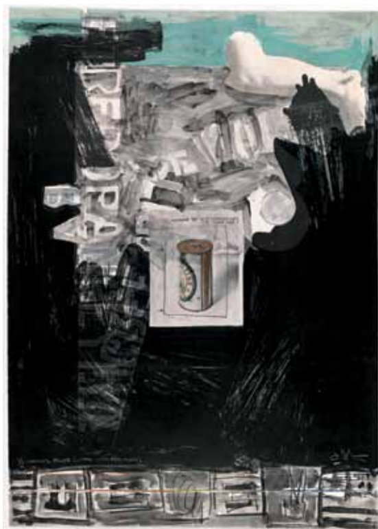
↑ JASPER JOHNS. Decoy , Patron's Permanent Fund and Special Friends of the National Gallery of Art