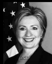
Hillary Rodham Clinton Secretary of State