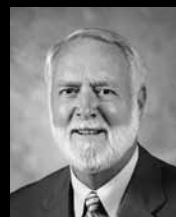
G. Wayne Clough Secretary of the Smithsonian Institution