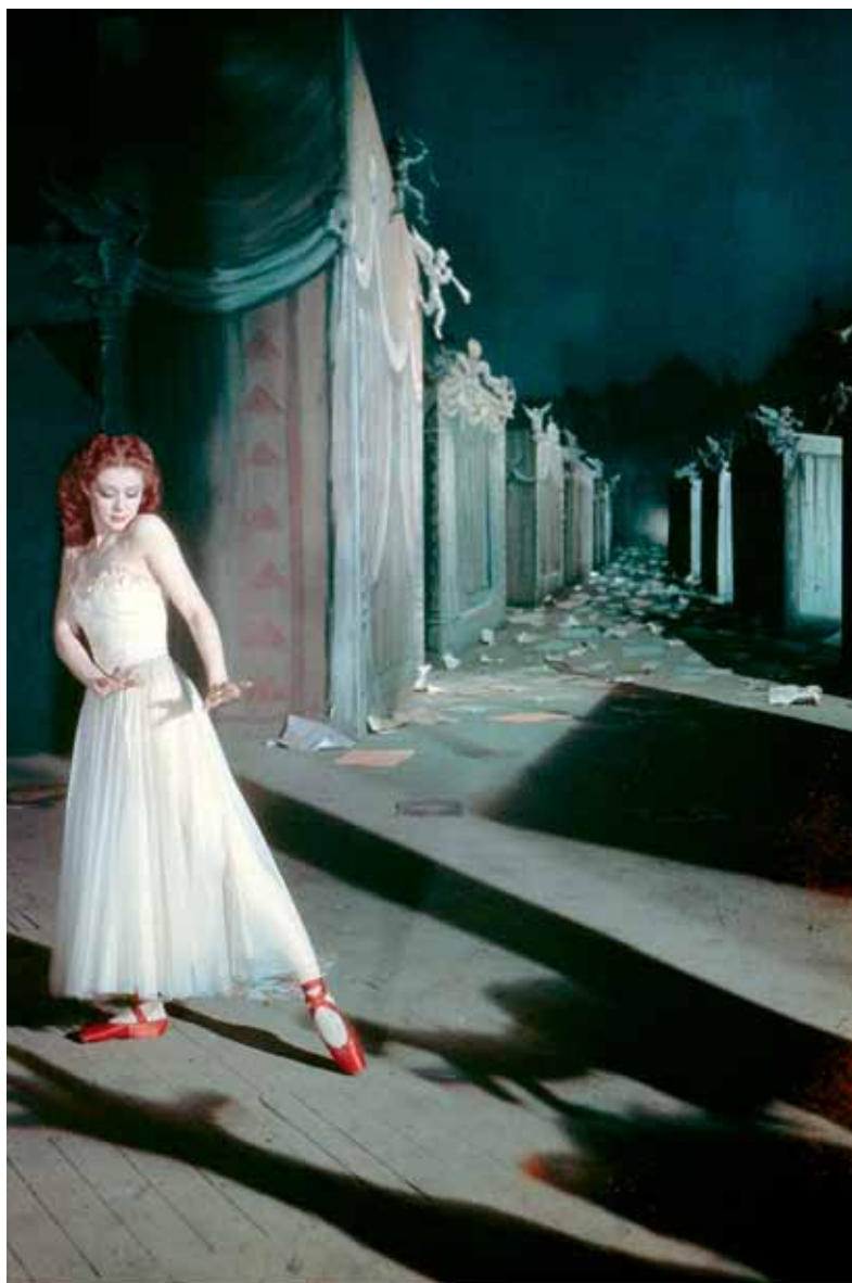
↑ The Red Shoes, 1948, Michael Powell and Emeric Pressburger

A two-year Samuel H. Kress Foundation grant, awarded to the department in 2008 to conserve, digitize, and catalogue approximately 8,000 historic negatives of the works of art in the Samuel H. Kress Collection that were donated to the Gallery in 1977, made significant progress this fiscal year. The most recent term of a series of Samuel H. Kress Foundation grants, supporting the department's conservation program since 1999, concluded in August when a conservator was hired for the newly established department of photograph conservation. In 2010, eleven rare albums and 368 photographs were examined and treated.