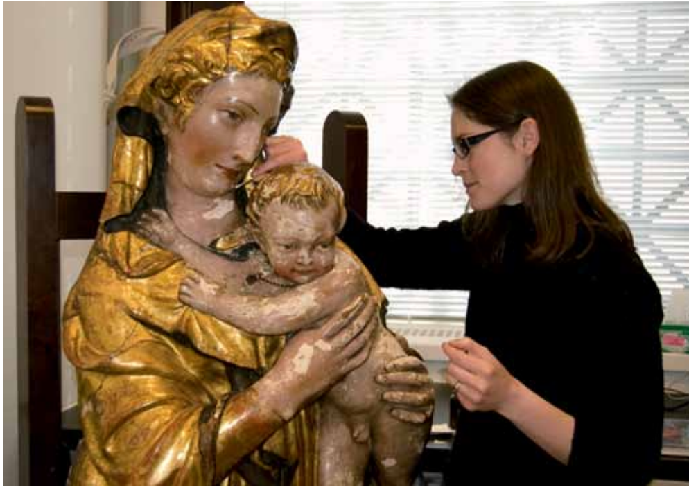
↑ Old and discolored restoration layers are removed from the fifteenth-century Florentine Madonna and Child .

Object conservators completed 155 major and minor treatments and 500 examinations. Of particular importance was the long-awaited conservation of the fifteenth century Florentine Madonna and Child and the carved marble The Young Saint John the Baptist by Gianfrancesco Susini. An in-depth technical examination in collaboration with Gallery scientists helped determine the original paint layering on the painted and gilded terra-cotta Madonna , enabling conservators to return its surfaces to the accurate coloration. Research also revealed that the relief is unique in its wood back construction and that its detailed craftsmanship suggests an important commission for a wealthy patron.