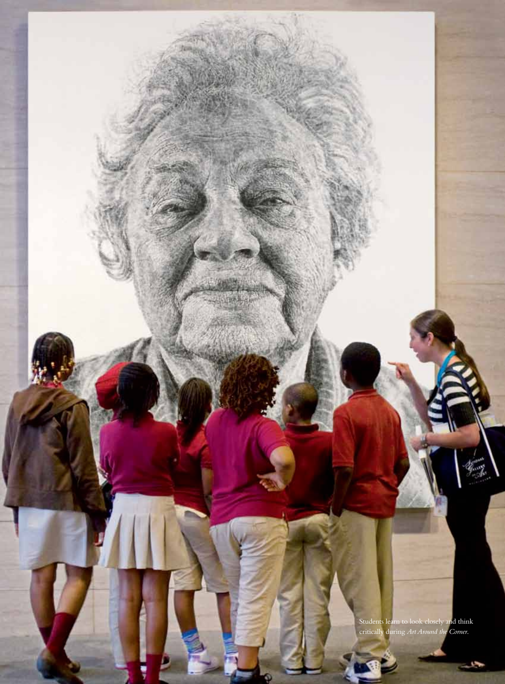
Students learn to look closely and think critically during Art Around the Corner .