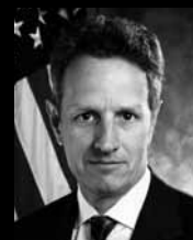
Timothy F. Geithner Secretary of the Treasury