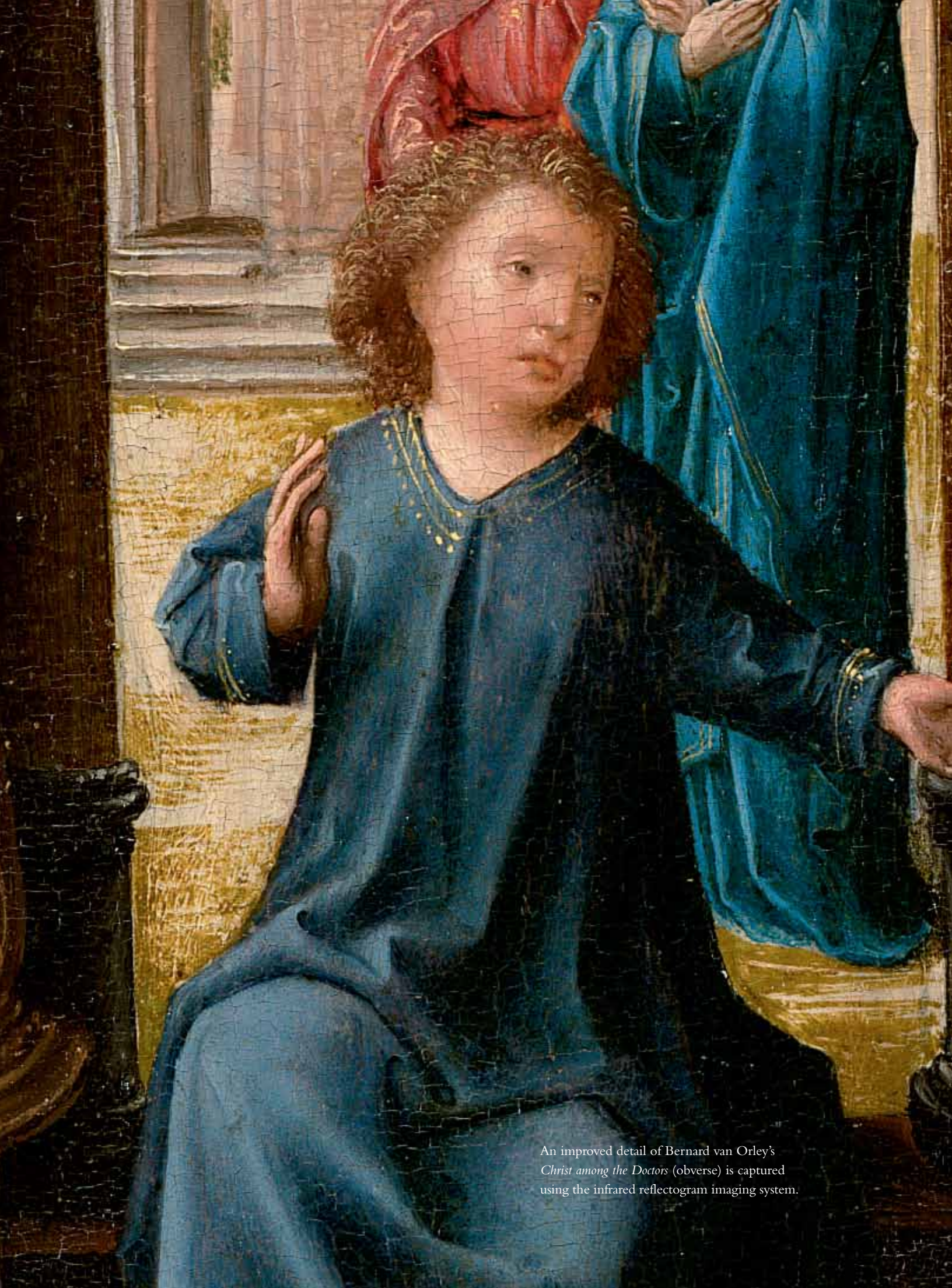
An improved detail of Bernard van Orley's Christ among the Doctors (obverse) is captured using the infrared reflectogram imaging system.