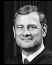
John G. Roberts Jr. Chief Justice of the United States