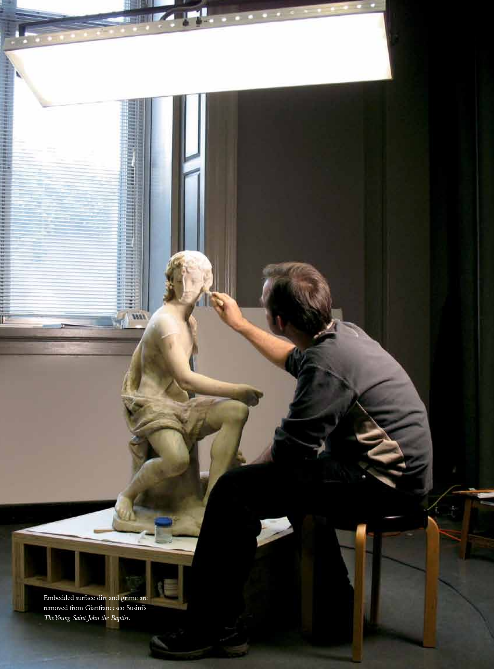
Embedded surface dirt and grime are removed from Gianfrancesco Susini's The Young Saint John the Baptist .