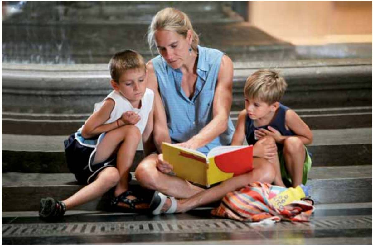
↑ Visitors enjoy the Gallery's Rotunda before attending the Stories in Art program.

NGAKids was included in Disney's top ten list of the best children's Web sites and received the Disney Family Fun award.