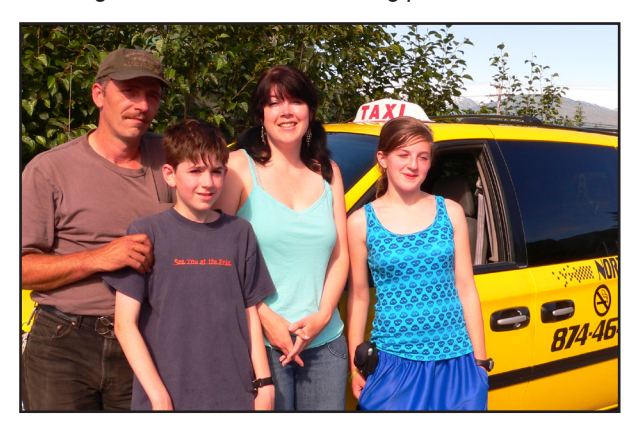
Healthy Wrangell is letting local businesses who have adopted smoke-free policies know we appreciate them.