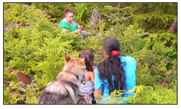
During the hike and harvest program this summer, families, including the dogs, picked berries and other local foods. (The dogs really eat berries right off the berry bush, but they prefer them from the sticky hands of children.)