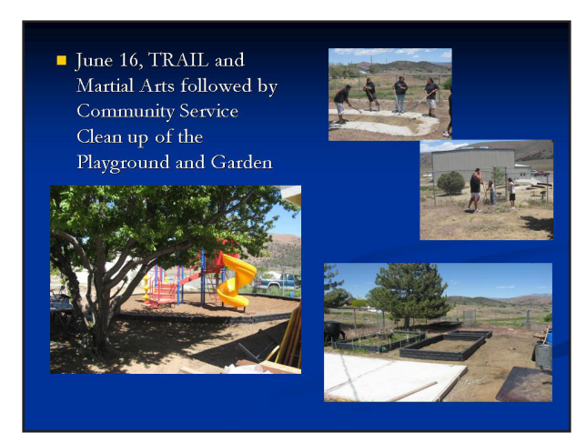
PowerPoint slides from presentations about LYFT