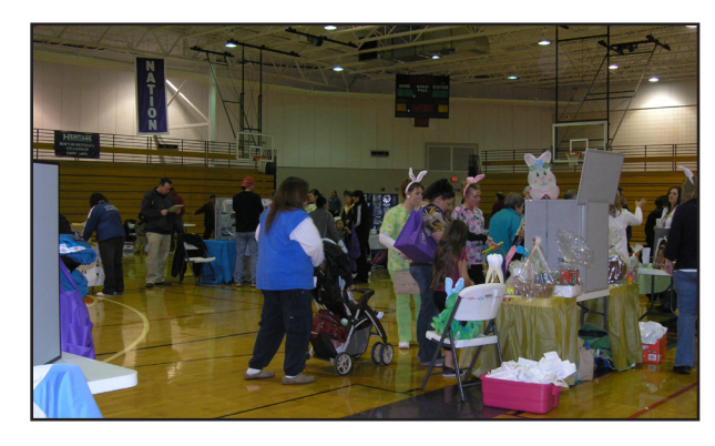
2010 OHPDP calendar and Spring Fling Health Fair