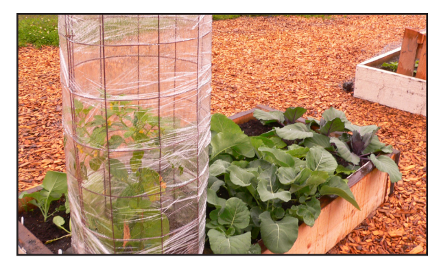
Yummy vegetables... Tomatoes don't like to be outside in Alaska, so we make personal greenhouses for them. Growing food in Alaska is a learning process!