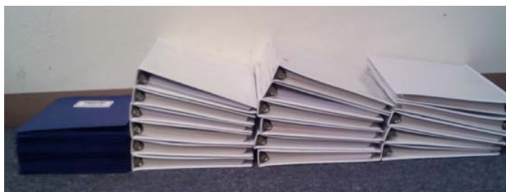
Seventeen white manuals as they have historically been issued compared to seventeen blue folders, including electronic materials to be used in FY10 RPMS courses.

Beginning in FY10, many Office of Information Technology - (OIT-) sponsored Resource and Patient Management System (RPMS) courses are going green and transitioning from paper training manuals to electronic training materials. Participants will receive all of the reference materials they have in past courses, but now will have the ability to easily reference and share materials with coworkers.