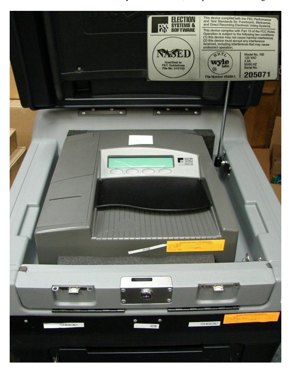
Photograph 1: Model 100 (on plastic ballot box)

The Model 100 is a precinct-based, voter-activated paper ballot tabulator that uses advanced Intelligent Mark Recognition (IMR) visible light scanning technology to detect completed ballot targets. The Model 100 is designed to alert voters to overvoted races, undervoted races, and blank ballots. It accepts ballots inserted in any orientation. Once the ballot is scanned by the Model 100, it is passed to the integrated ballot box.