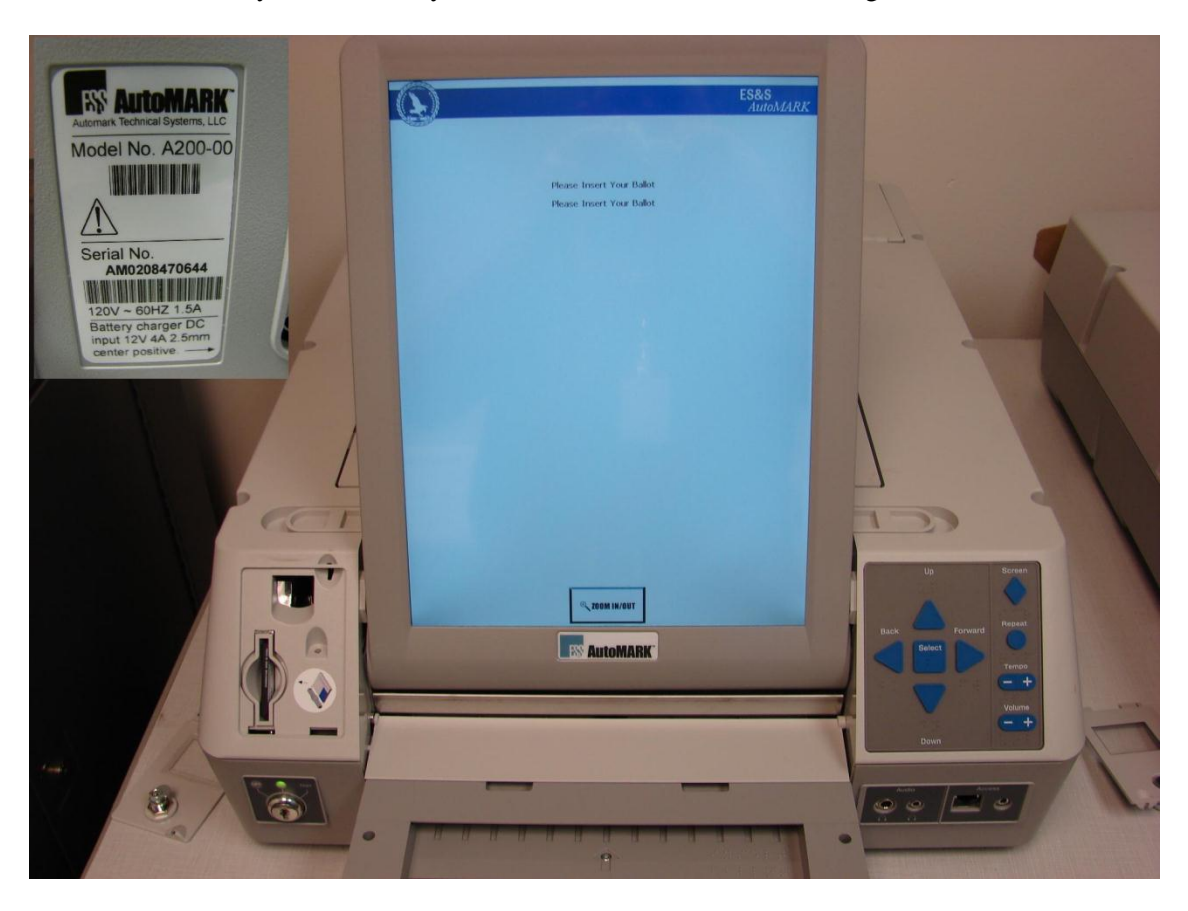
Photograph 6: AutoMARK A200 VAT

Regardless whether the voter uses the touch screen or other audio interface, changes can be made throughout the voting process by navigating back to the appropriate screen and selecting the change or altering selections at the mandatory vote summary screen that closes the ballot marking session.