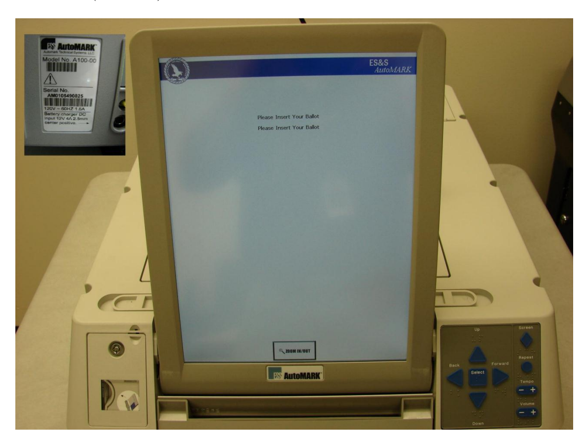
Photograph 7: AutoMARK A100 VAT