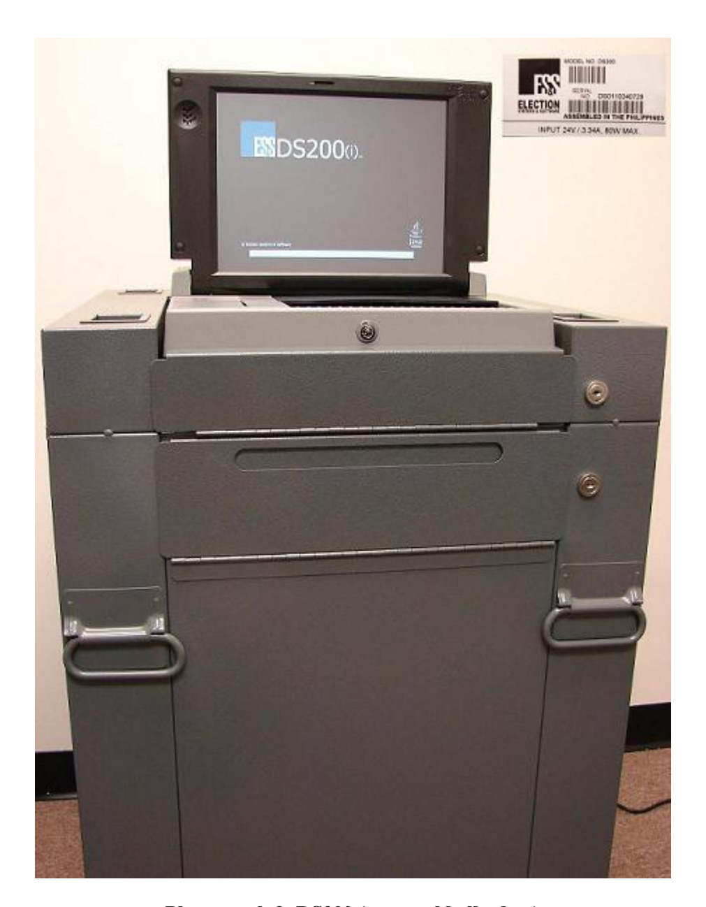
Photograph 3: DS200 (on metal ballot box)