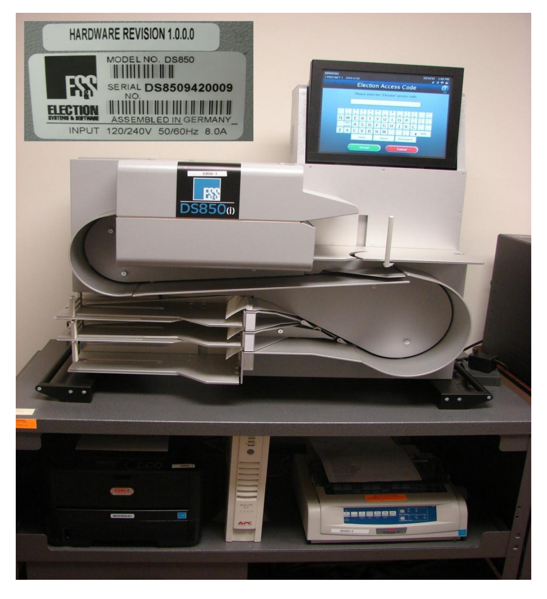
Photograph 4: DS850

The DS850 is a high-speed, optical scan central ballot counter. During scanning, the DS850 prints a continuous audit log to a dedicated audit log printer and can print results directly from the scanner to a second connected printer. The scanner saves results internally and to results collection media that officials can use to format and print results from a PC running Election Reporting Manager. The DS850 has an optimum throughput rate of nearly 400 ballots per minute and uses advanced cameras and imaging algorithms to image the front and back of a ballot, evaluate the results and sort ballots into discrete bins to maintain continuous scanning within fractions of a second.