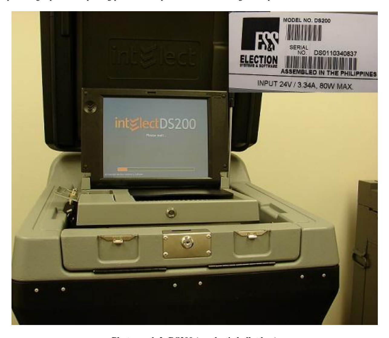
Photograph 2: DS200 (on plastic ballot box)

The system includes a 12-inch touch screen display providing clear voter feedback and poll worker messaging. Once a ballot is tabulated and the system updates internal vote counters, the ballot is dropped into an integrated, secure ballot box. The DS200 includes an internal thermal printer for the printing of zero reports, log reports, and polling place totals upon the official closing of the polls.