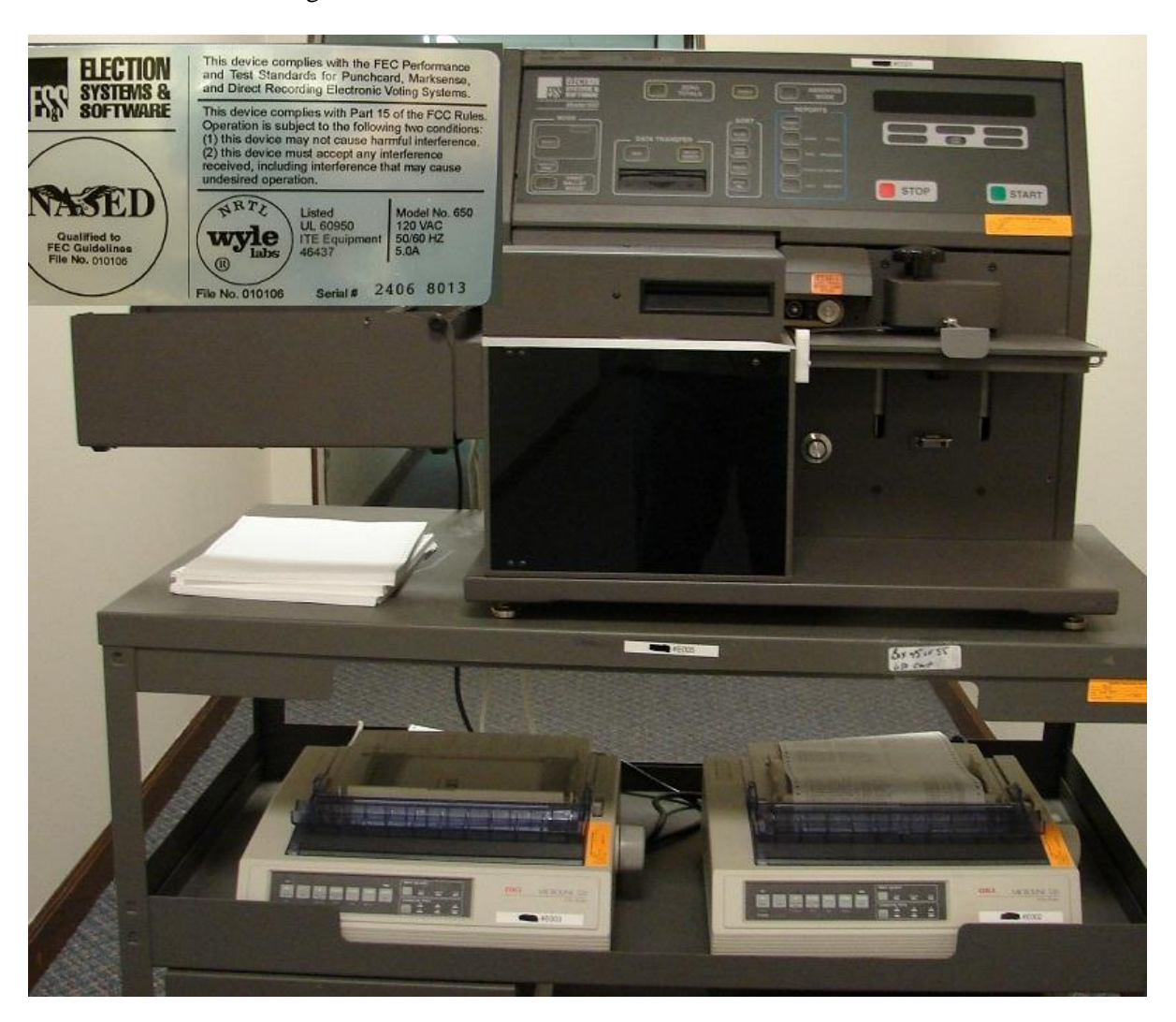
Photograph 5: M650

The Model 650 is a high-speed, optical scan central ballot counter. During scanning, the Model 650 prints a continuous audit log to a dedicated audit log printer and can print results directly from the scanner to a second connected printer. The scanner saves results to a Zip disk that officials can use to generate results reports from a PC running Election Reporting Manager. The Model 650 sorts write-in ballots, blank ballots, overvoted ballots and illegal ballots.