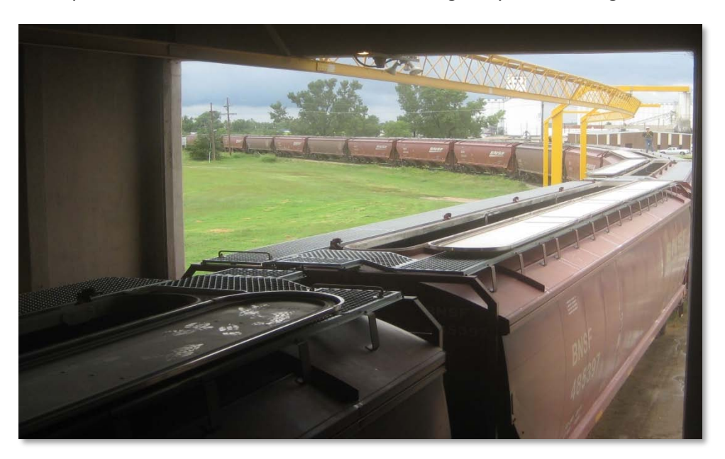
Facility with approved railcar video stowage exam system in Hutchinson, Kansas.

As of September 2010, 23 facilities have been reported to FGIS as having approved video stowage exam systems. This represents an increase of 13 facilities since the 2009 report. Two of the systems are approved for night use only due to lighting issues. The systems have been reported as working well, provided the camera lenses are cleaned regularly to remove grain dust.