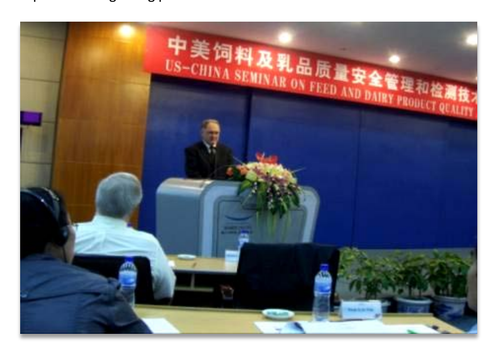
FGIS officer at the U.S.-China Seminar on Feed and Dairy Product Quality and Safety

While in the region, the FGIS officer met with importers and processors and was able to address their quality concerns and misunderstandings regarding contract specifications and grain grading. Several feed mills expressed interest in future training seminars on U.S. grain standards, inspection and grading procedures.