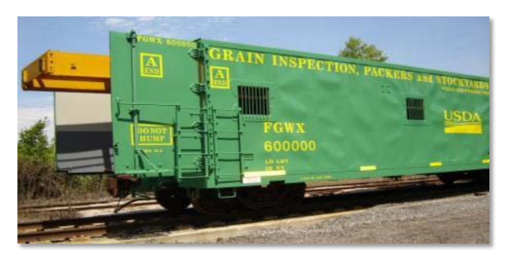
GIPSA replaces nearly 50-year-old test car with first of 2 units - FGWX600000

calibrations associated with the program. In accordance with AAR interchange rules, FGIS must replace rail cars before they reach 50 years of age. Two of the test cars operated by FGIS are near the 50-year mark and need to be replaced. The first replacement test car was completed near the end of June 2010. FGIS has funded the procurement of both test cars, and the AAR donated one used box car. The AAR has also increased FGIS annual funding in a recently completed 10-year agreement to continue the Master Scale Calibration Program. FGIS owns and operates three other test cars, which are primarily used to test track scales owned by grain companies and other commercial entities.