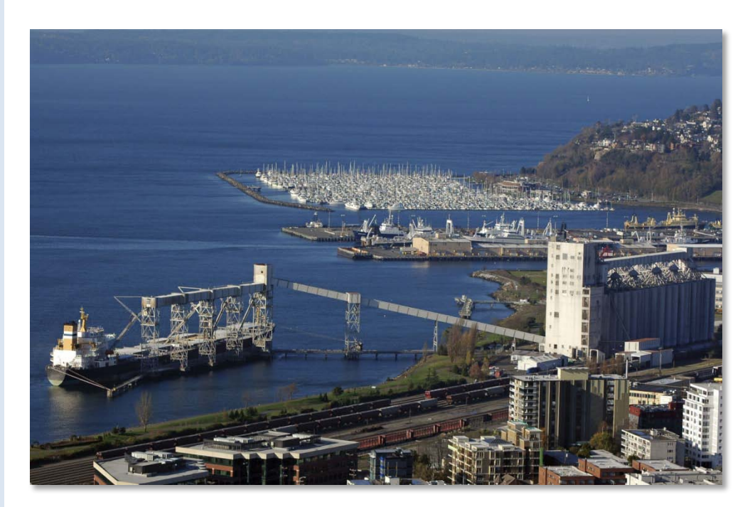
Bulk vessel loading grain at Pier 86 Grain Terminal, Elliot Bay, Seattle, Washington

The Act requires that all persons who buy, handle, weigh, or transport 15,000 metric tons or more of U.S. grain for sale in foreign commerce during the current or previous calendar year must register with FGIS. During 2010, FGIS issued 135 Certificates of Registration to individuals and firms to export grain.