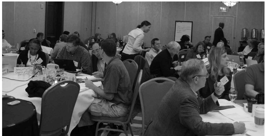
Members of the Medicaid Medical Directors Learning Network collaborate.

For example, Medicaid patients are 70 percent more likely to be readmitted to the hospital within a month of their initial hospitalization than their privately insured counterparts. These are