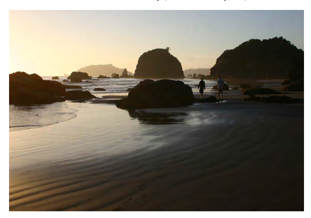
Button Rock at low tide (Houda Point, Trinidad Bay (Humboldt County, CA)

[NOTE: Images from the CCNM Traveling Photo Exhibit should be posted on the CCNM website before the end of February 2009.]