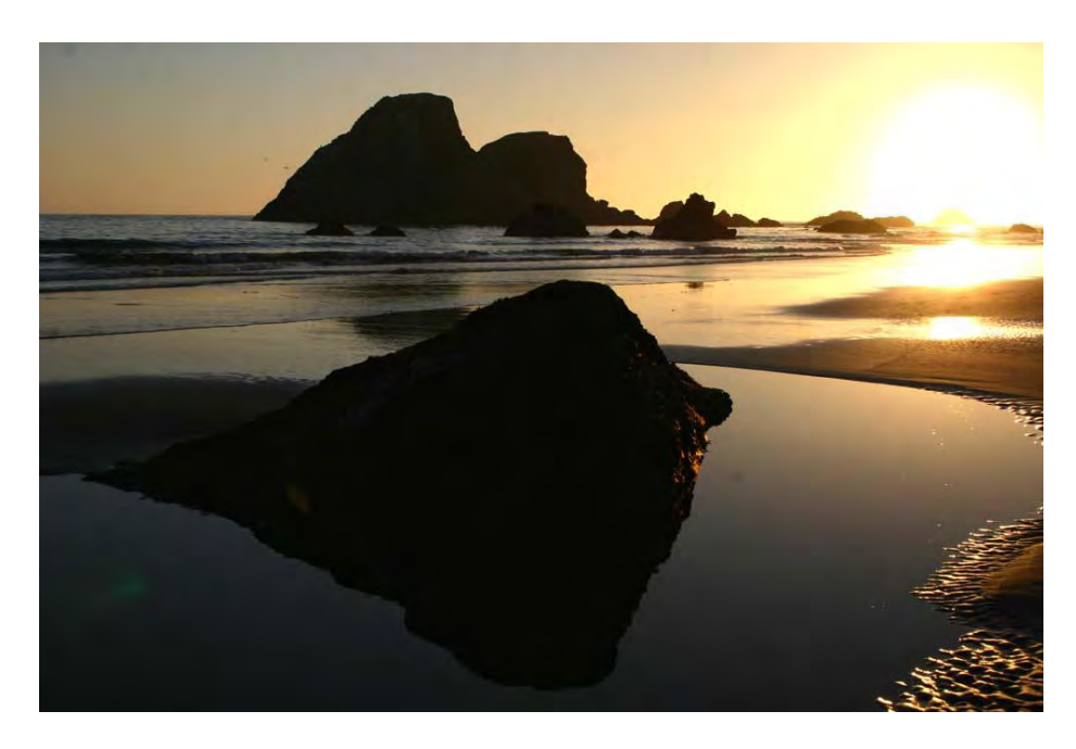
Sunset behind Camel Rock in Trinidad Bay (Humboldt County, CA)