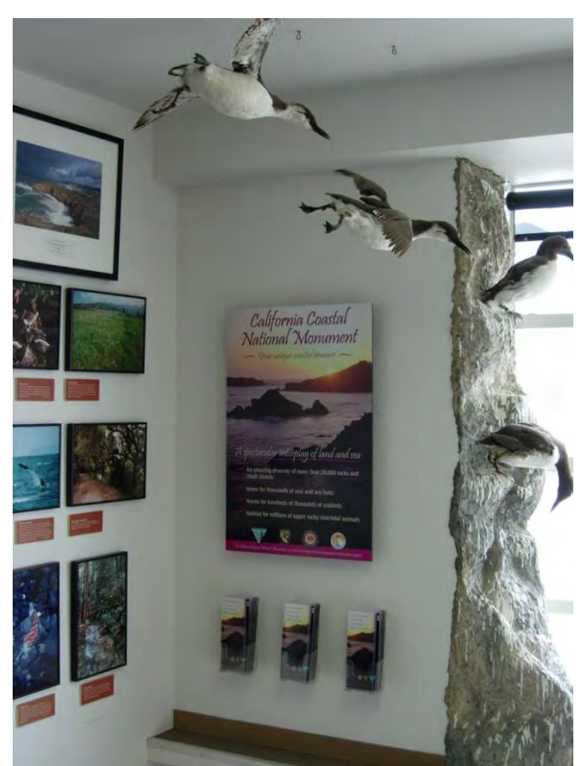
...and as "CCNM visitor contact stations," such as the Pacifica Chamber of Commerce (a CCNM Collaborative Partner) Visitor Center at Rockaway Beach in Pacifica, CA.