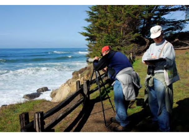
The Sea Ranch CCNM Stewardship Task Force "citizen scientists" and BLM biologists monitoring nesting cormorants (above) and other seabirds as part of an intensive monitoring program conducted primarily on donated time by a very dedicated group of "CCNM Stewards" (Sea Ranch, Sonoma County, CA)