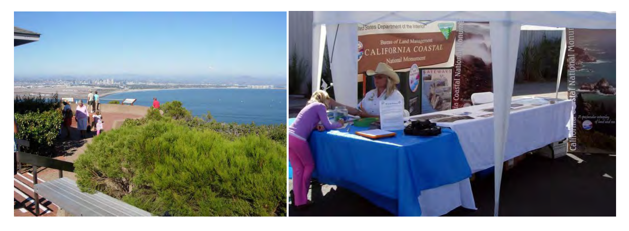
CCNM was an exhibitor at an all-day "Celebration of San Diego Parks, Natural Areas and Open Space" on the anniversary of the National Park Service's Founder's Day at Cabrillo National Monument, on August 25, 2009, BLMers handed out CCNM and National Landscape Conservation System brochures and CCNM pencils and posters, discussed the CCNM and NLCS, and provided the opportunity for kids to make pelican headbands or borrow binoculars.