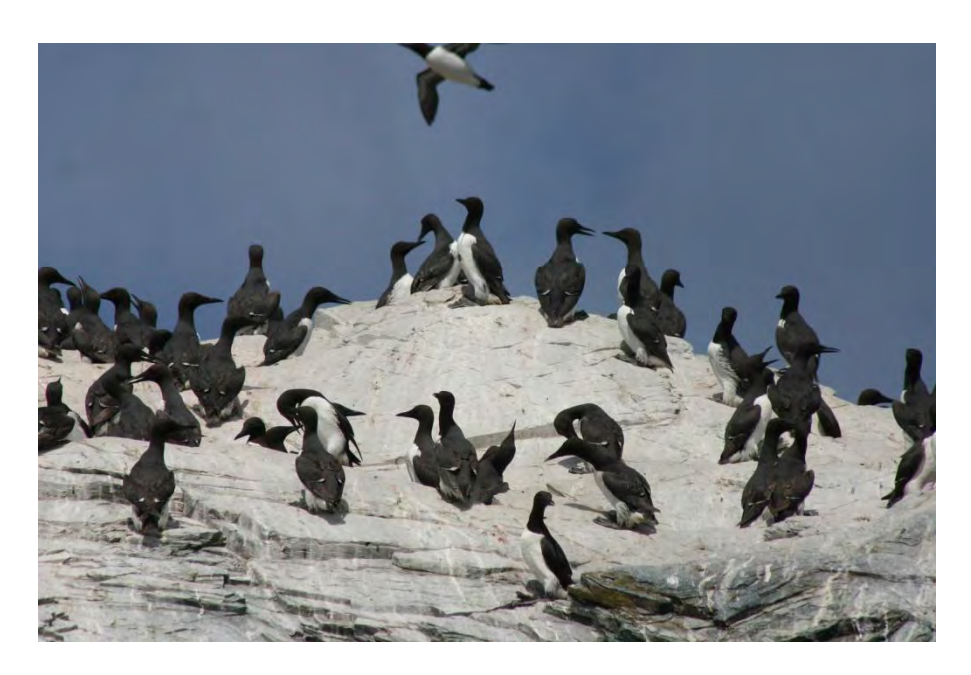
Common Murre on Flatiron Rock north of Trinidad (Humboldt County, CA)