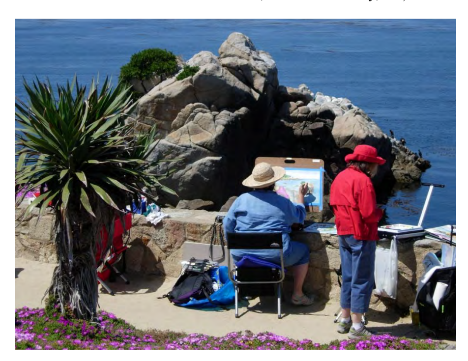
Art class using a CCNM rock at Pacific Grove on the Monterey Peninsula (Monterey County CA).