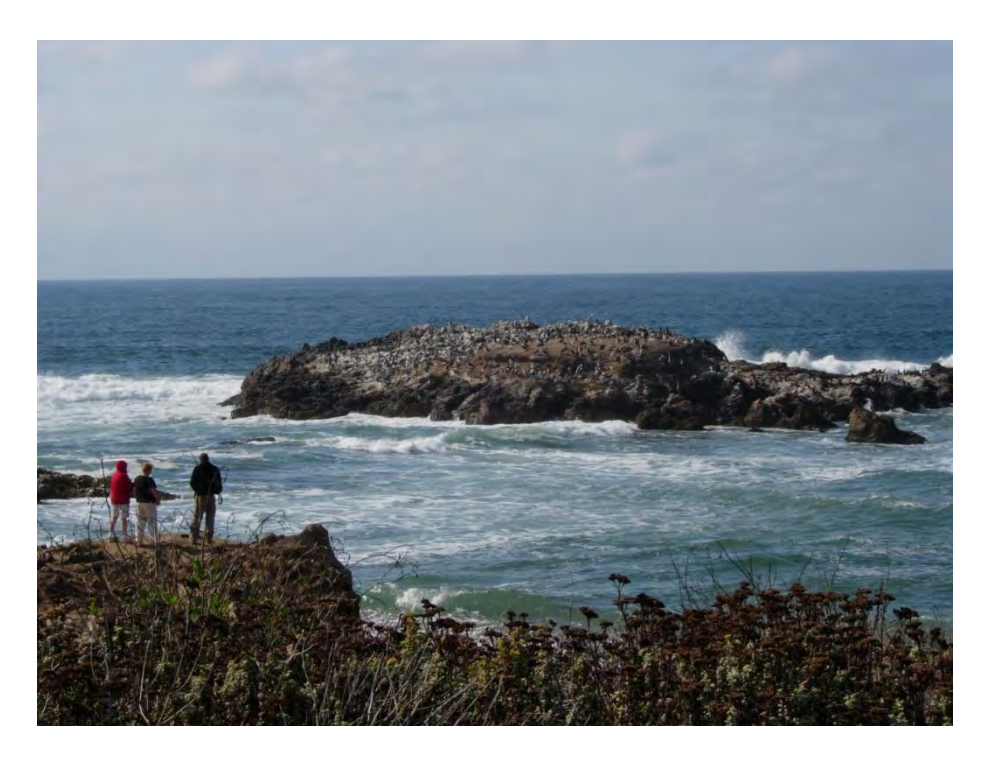
The CCNM is the most viewed of all the Nation's national monuments, but most viewers do not know that they are looking at a National Monument. Millions of people each year drive along the California coast and see or stop to view the ocean and use the rocks as a focal point for handling the ocean's vastness. (Photo is of Pescadero Rock off Pescadero State Beach, San Mateo County, CA)