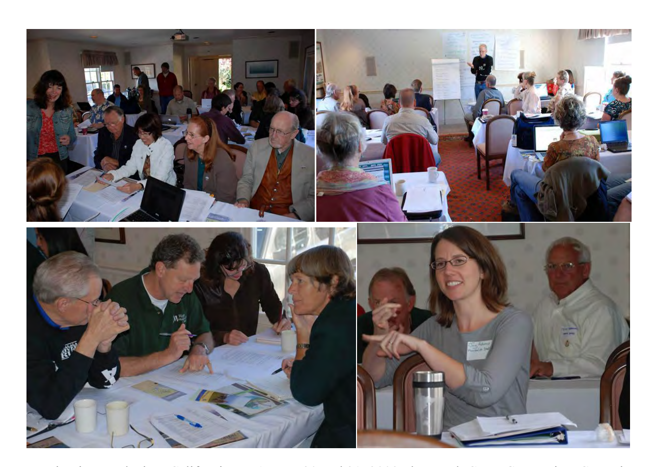
Meeting in Mendocino, California, on August 20 and 21, 2009, the North Coast Geotourism Committee reviewed the more than 900 site nominations gathered and submitted during the initial phase of developing the North Coast Geotourism MapGuide with the National Geographic Society and coordinated by the BLM's California Coastal National Monument.