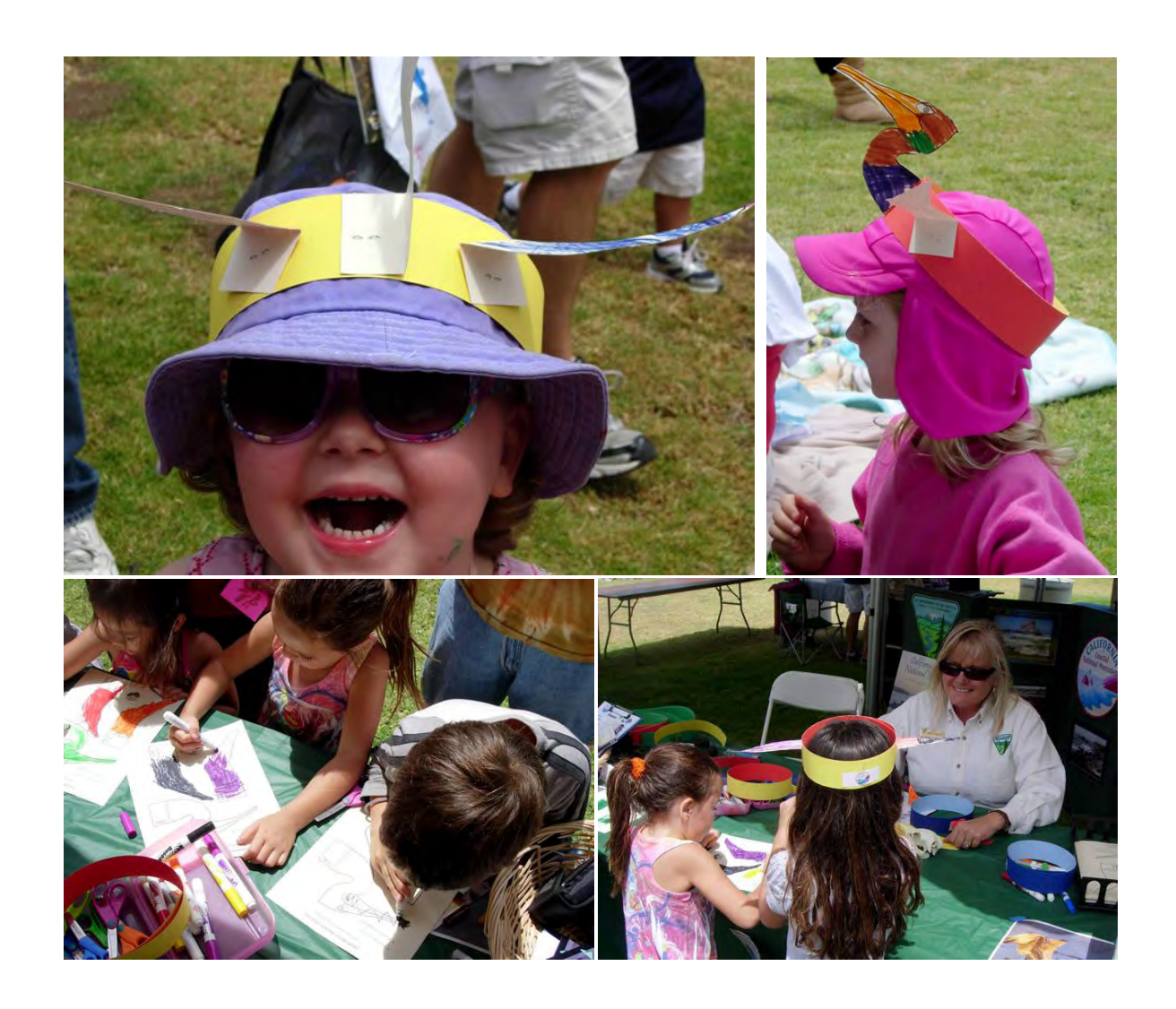
For the fourth year in a row, CCNM had a booth at the Monterey Bay National Marine Sanctuary's Coastal Discovery Fair held at Randolph Hearst Memorial State Beach in San Simeon on July 11, 2009. At the BLM booth, more than 100 kids colored, cut and assembled pelican headbands.