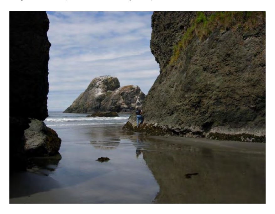
Button Rock and Camel Rock from sea level. Note the person standing on the base of Button Rock (Humboldt County, CA).

Although no portion of the CCNM is onshore, at low tide some of the rocks and islets are accessible on foot. BLM is currently considering developing local docent programs to provide limited guide tours in appropriate area. This location may be one such area. It is adjoining a regional park with a trail and stairway to the beach below. Many of this CCNM rocks and islets are much larger than they may appear from onshore. Note the four people and a dog in the center of this photo (Button Rock and Camel Rock off Houda Point Regional Park (Humboldt County, CA).