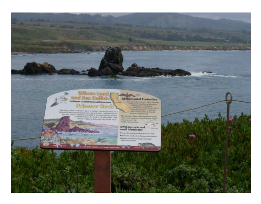
CCNM uses existing venues for interpretive signing as here at Whaler's Cove off Pigeon Point Light Station State Historic Park (San Mateo County, CA)...