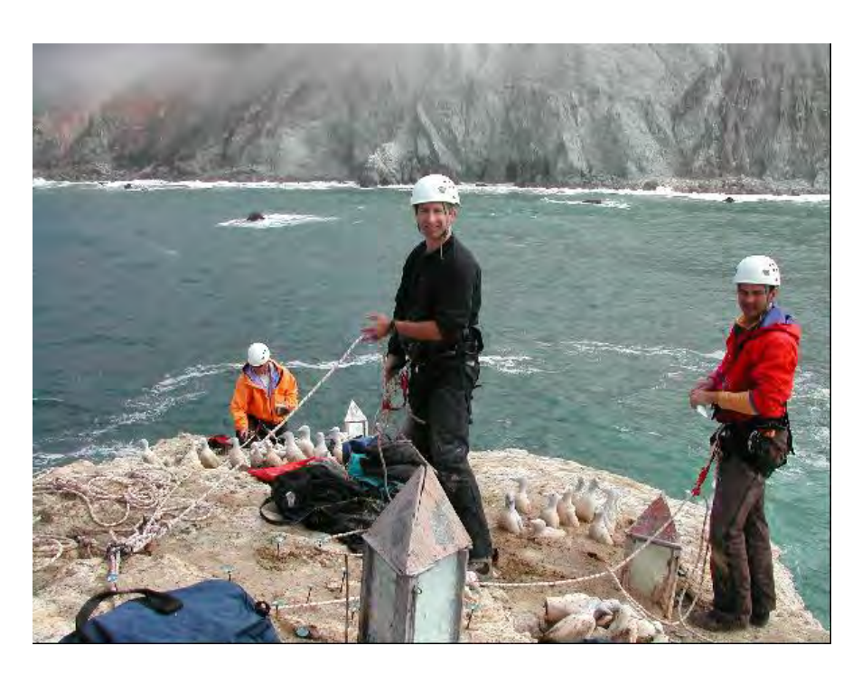
U.S. Fish & Wildlife Service biologists removing Common Murre decoys from Devil's Slide Rock south of Pacifica (San Mateo County, CA)