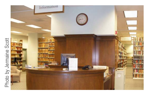
National Archives Library, Washington, DC