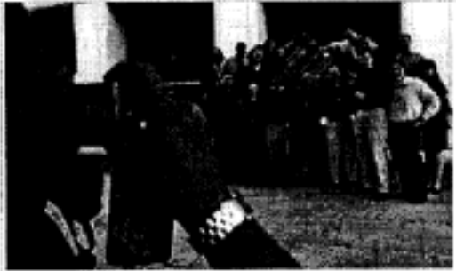
Grinning and bearing it

financial products, including credit derivatives. Enron, in effect, abandoned its roots as an energy provider in favour of becoming a Wall Street trader that just happened to be based in Houston, Texas-in effect, a hedge fund with a gas pipeline on the side.