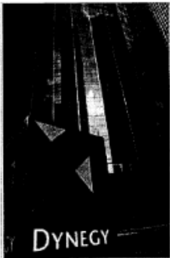
Friends no more

But as Enron tries to hold on to the trading business, and sell other assets, it will be dealing with regulatory investigations, fighting off a raft of lawsuits, and pursuing one of its own. It is suing Dynegy for $10 billion for backing out of the merger. It is also trying to stop Dynegy from exercising an option to take possession of the Northern Natural Gas pipeline, its most valuable asset. Stung by this move, on December 3rd, Dynegy countersued for the pipeline, and dismissed Enron's suit as "frivolous and disingenuous".