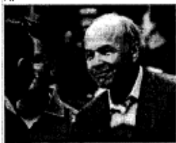
Lay is down

AS DOWNFALLS go, it has been spectacular. In February, Enron was worth $60 billion. Its founder, Kenneth Lay, was a close friend of George Bush and his family. Now the energy trading giant has filed for the world's biggest-ever corporate bankruptcy and is fighting a host of lawsuits. But it may be too soon to bury Enron, known as the most innovative and aggressive of energy traders. On December 3rd, a day after it filed for bankruptcy following the withdrawal of a merger offer by Dynegy, a smaller rival, it had lined up $1.5 billion in additional funding. If secured—and its key bankers, J.P. Morgan Chase and Citigroup, need to persuade other banks to join the syndicate—it could mean that the energy-trading firm survives in America. Whether the Enron name survives is another matter. Meanwhile, rivals are circling to pick up the pieces of its other businesses elsewhere in the world.