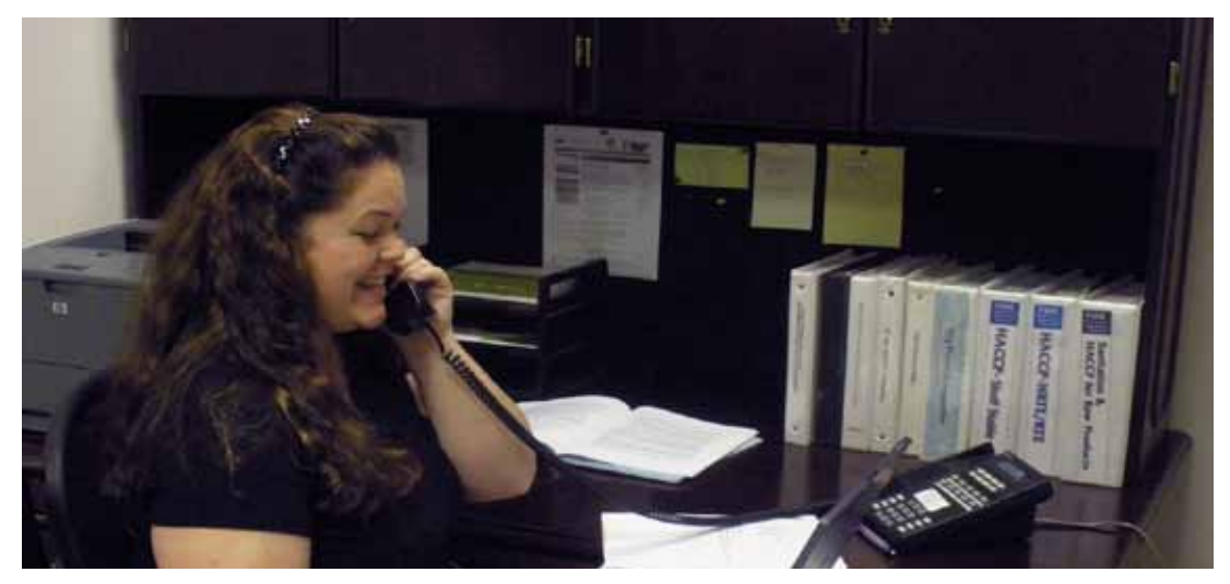
"If I sell chicken and pork products, can I ship them together in the same box?"

"How do I appeal a non-compliance record?" "I just received a form in the mail from the USDA; can you help me understand it?"