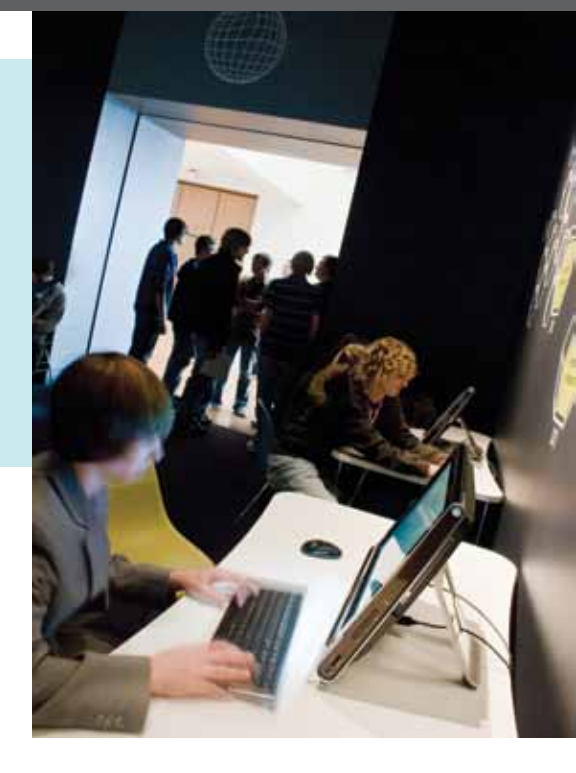
Right: Visitors to the Indianapolis Museum of Art check out the museum's online offerings in The Davis LAB.

A democratic society in the knowledge age demands that its citizens learn continually, adapt to change readily, and evaluate information critically.