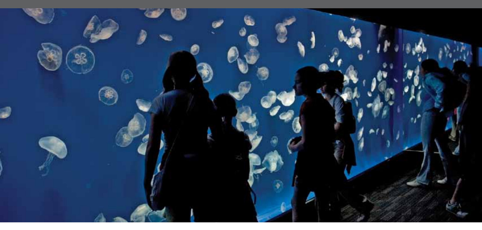
Above: The Tennessee Aquarium's Jellies: Living Art gallery.

There are more than 4.5 billion objects held in public trust by museums, libraries, archives, and other collecting institutions in the U.S.