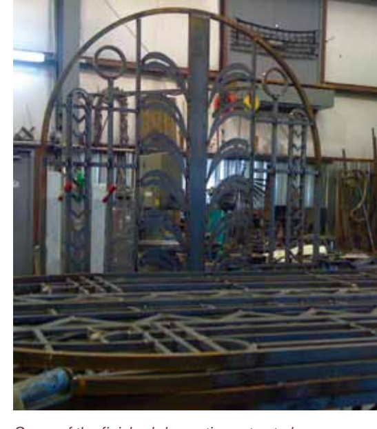
Some of the finished decorative gates to be used in the arches of an abandoned railroad underpass in Greensboro, North Carolina, part of the MICD25-supported Downtown Greenway project that will enhance the urban landscape.

The Arts Council of Winston-Salem and Forsyth County was the country's first formally established arts council, and represents how cities can merge creativity with business to spearhead economic development, create jobs, and foster cultural vibrancy. During his two-day stay, Rocco interacted with a