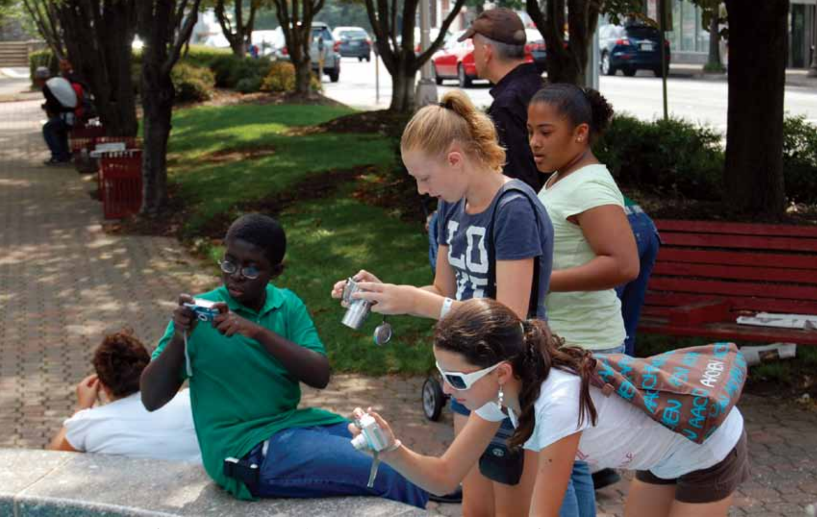
"This is My City/Esta es mi cuidad" was a field trip-based workshop by the Arlington Arts Center—which received an FY 2010 NEA Learning in the Arts grant—in which Arlington teens documented their surroundings as part of a photography exchange program with the Centro Arte para la Paz in Suchitoto, El Salvador.

Summer 2010 saw the launch of a new NEA initiative, Blue Star Museums, through a partnership among the NEA, Blue Star Families-a not-forprofit organization dedicated to supporting and connecting military families-and more than 1,000 museums that participated in the initiative. Blue Star Museums offered free museum admission to active duty military personnel and their families from Memorial Day through Labor Day, making the arts more accessible for the nation's servicemen and women and their families. This initiative expanded the agency's past programs for members of the military, and provided a way for the Arts Endowment to thank those who serve our country. Blue Star Museums proved so successful that a second year of the program will take place in summer 2011.