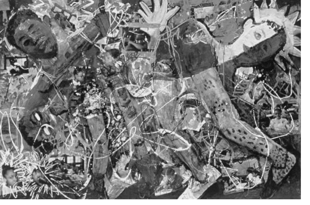
A large-scale, mixed-media mural, created by students through a Hyde Park Arts Center project, hangs in the entrance hallway of the park.