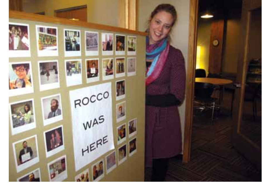
Springboard for the Arts proudly showing a sign that the chairman had visited.