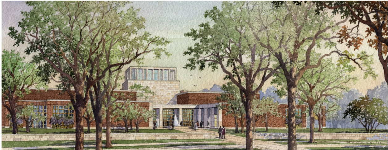
Library and Museum Approach