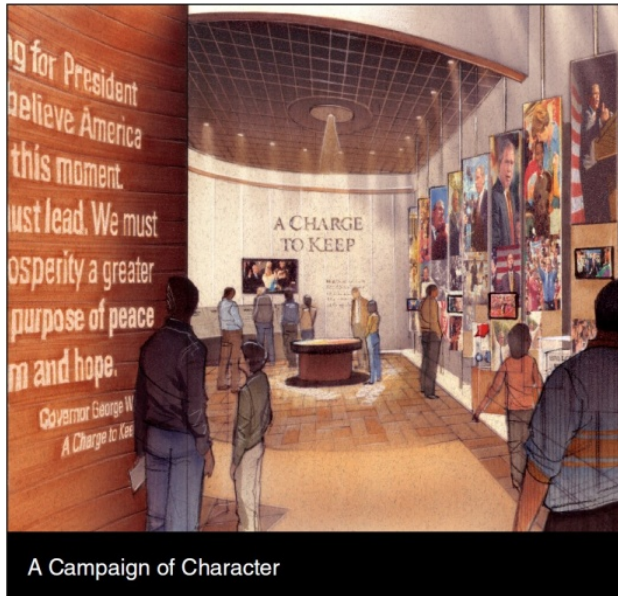
A Campaign of Character

The George W. Bush Presidential Library and Museum will feature an evocative and compelling permanent exhibition that uses artifacts, documents, and immersive audiovisual environments to capture the key decisions and events of the Presidency of George W. Bush. The permanent exhibition is framed on four principles that are vitally important to the President and Mrs. Bush and that guide their actions: freedom, responsibility, opportunity and compassion . Interactive features, including an exciting Decision Theater, will allow visitors to learn even more in an entertaining way. The Museum will feature a full-size Oval Office and Texas Rose Garden. Additionally, the Museum will present temporary exhibitions that complement the permanent exhibit and illustrate themes and subjects relevant to the mission of the George W. Bush Presidential Library and Museum.