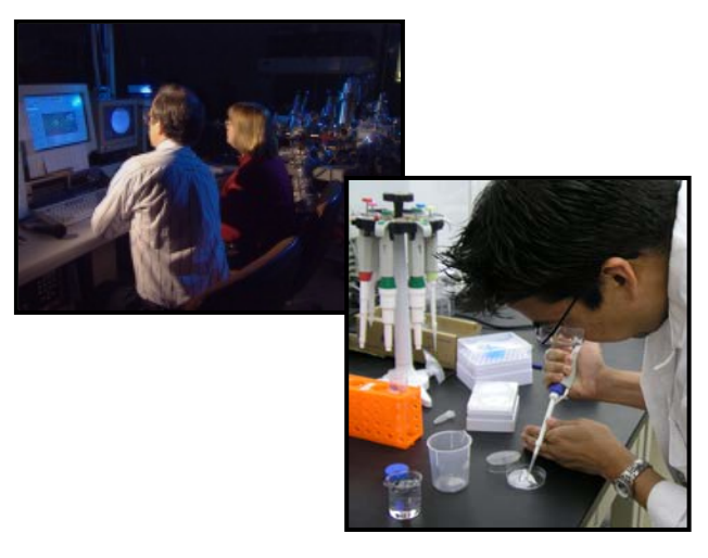
A Collaborative Research Environment