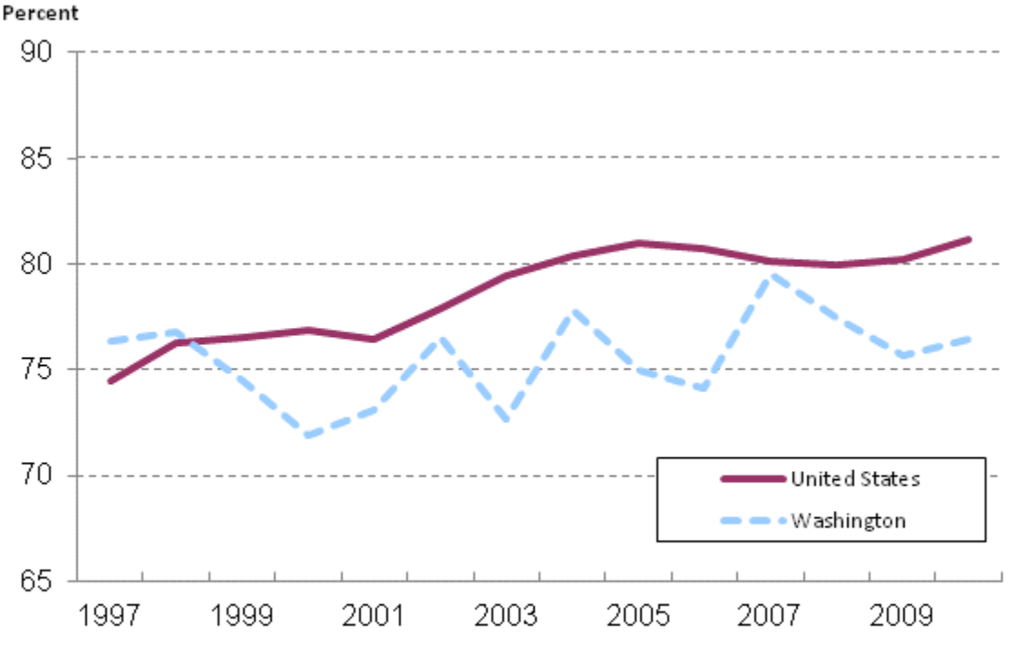
Chart 1. Women's earnings as a percent of men's, full-time wage and salary workers, Washington and the United States, 1997 – 2010 annual averages

In Washington, the ratio of women's to men's earnings ranged from a low of 71.9 percent in 2000 to a high of 79.5 percent in 2007. The ratio has been generally trending upwards over the past decade. (See chart 1.)