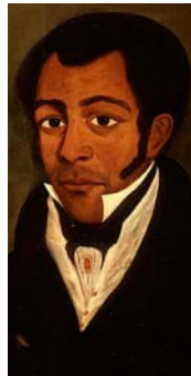
Unknown painter Portrait of a Black Man