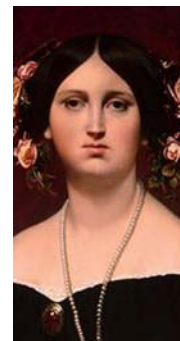
Jean-Auguste-Dominique Ingres Madame Moitessier