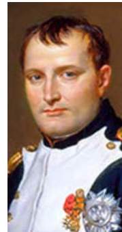
Jacques-Louis David The Emperor Napoleon...