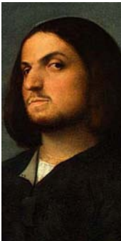
Giorgione and Titian Portrait of a Venetian Gentleman