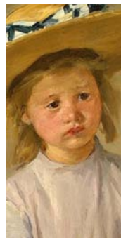
Mary Cassatt Child in a Straw Hat