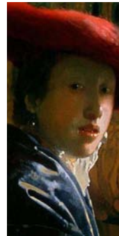
Johannes Vermeer Girl with the Red Hat