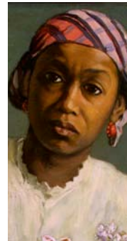
Frédéric Bazille Young Woman with Peonies