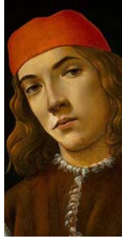
Sandro Botticelli Portrait of a Youth