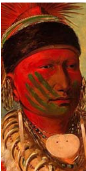
George Catlin The White Cloud...