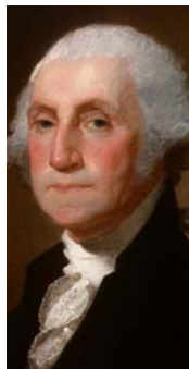
Gilbert Stuart George Washington