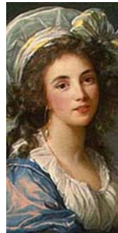
E. Vigée Le Brun The Marquise de Pezay...