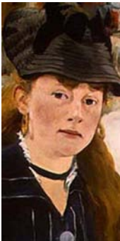
Edouard Manet The Railway