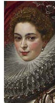
Sir Peter Paul Rubens Marchesa Brigida Spinola Doria