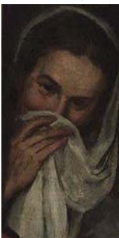
Bartolomé Esteban Murillo Two Women at a Window