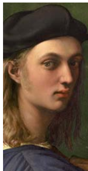
Raphael Bindo Altoviti