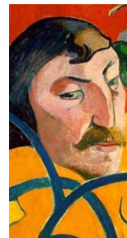
Paul Gauguin Self-Portrait