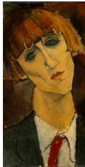
Amedeo Modigliani Madame Kisling