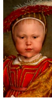
Hans Holbein Edward VI as a Child