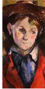
Paul Cézanne Boy in a Red Waistcoat