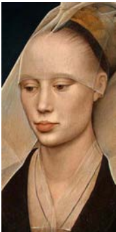
Rogier van der Weyden Portrait of a Lady