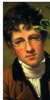
Rembrandt Peale Rubens Peale with a Geranium