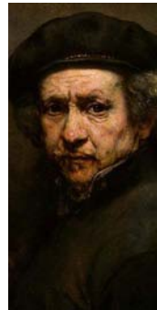
Rembrandt van Rijn Self-Portrait