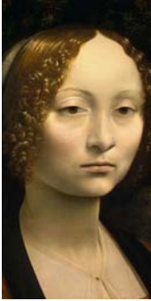
Leonardo da Vinci Ginevra de' Benci

The banners hanging on the light poles around the fountain are details from paintings in the permanent collection of the National Gallery of Art. Many of the works are on view in the West Building, just across Seventh Street.