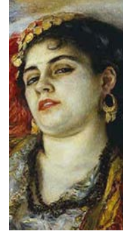
Auguste Renoir Odalisque