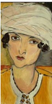
Henri Matisse Lorette with Turban, Yellow Jacket