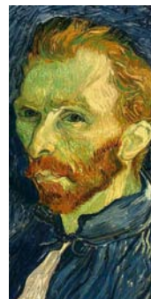
Vincent van Gogh Self-Portrait