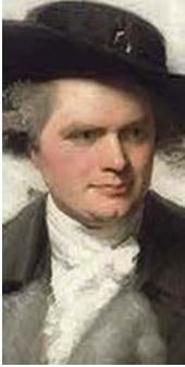
Gilbert Stuart The Skater...