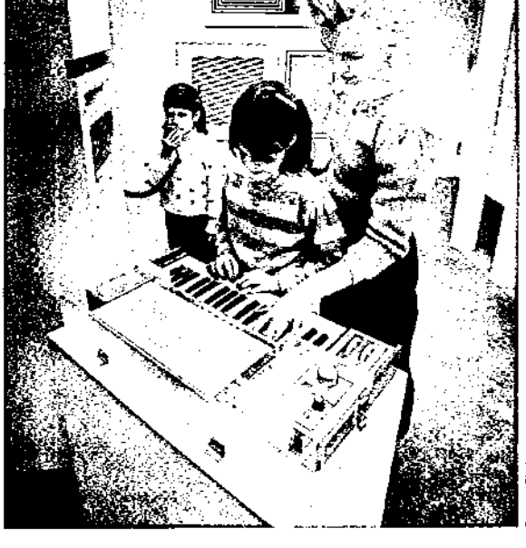
Students explore music's new technology in "SENSATION," a special youth exhibit at the High Museum of Art in Atlanta.