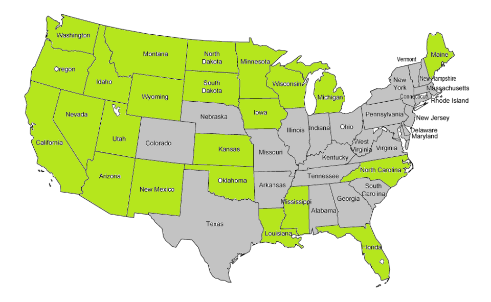
Distribution of BIE-funded Schools by State 23 States (shaded green)

<u>Schools in the BIE system.</u> The BIE is responsible for educating over 45,000 American Indian and Alaska Native students in 173 elementary and secondary academic programs located on 64 reservations in 23 states.<sup>6</sup> Over 56% of students attend BIE-funded schools in just four states: Arizona, South Dakota, New Mexico, and North Dakota.