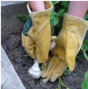
Wear gloves and wash hands after gardening and before eating.