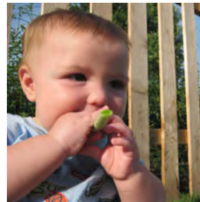
Uptake by plants and subsequent consumption.