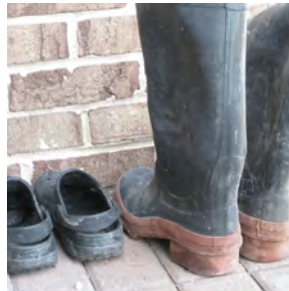
Take care not to track dirt from the garden into the house.