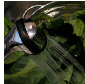
Clean produce before storing or eating.