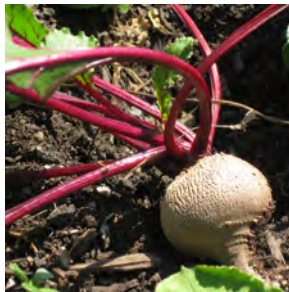
Peel root crops, and remove outer leaves of leafy vegetables.