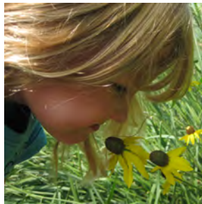
Inhalation of contamination.