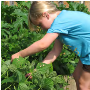
Direct exposure to contamination.