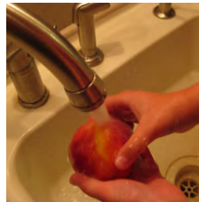
Teach kids to wash fruits and vegetables before eating.