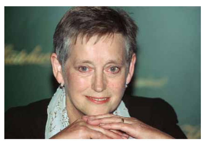
In December 1991 Stella Rimington became the first spy chief to be publicly named; the first to pose openly for cameras; and the first to publish a brochure.

Published fitfully between 1979 and 1990, the five volumes produced by Hinsley and his assistants were a monument to the triumph, but also to the inherent problems of intelli-