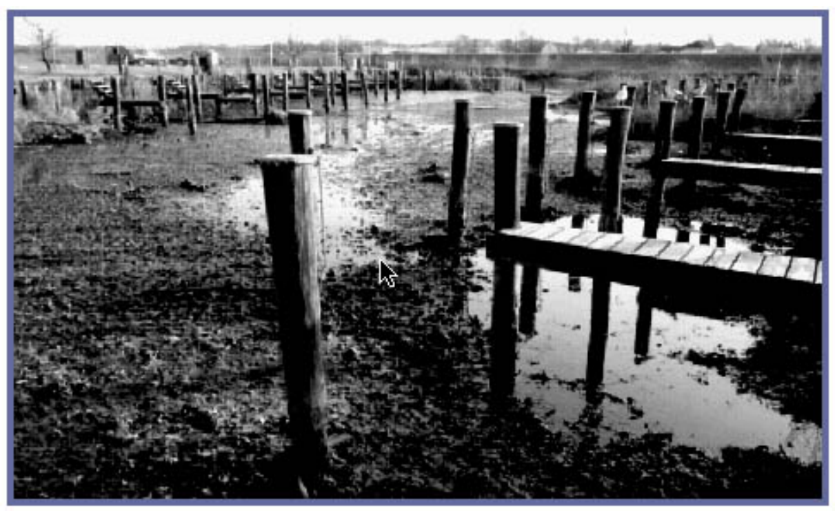
Effects of nonpoint source sediment run-off on Colonial Deep Water Port of Bladensburg, MD in Prince George's County.

Coastal waters are affected by both point and nonpoint sources of pollution, with the latter a significant and, in many cases, dominant form of pollution impacting coastal water bodies. Discharges from pipes are point sources of pollution. Nonpoint source pollution occurs when rain water washes over streets, yards, and farmlands and carries oils, pesticides, and fertilizers into rivers, estuaries, and oceans. Recognizing the negative impacts these pollutant sources have on estuarine and coastal water quality, Congress passed the Coastal Zone Act Reauthorization Amendments in 1990. This Act requires states to develop plans and management measures to protect coastal waters from nonpoint pollution impacts. It further requires that plans must be coordinated with other existing federal and state water quality protection programs, so that all protection efforts are integrated and potential overlap is reduced. The Coastal Nonpoint Source Program also requires that states provide ample opportunities for the public to be involved in developing and implementing protection plans. States have been working on their plans since 1993, and, after approval by EPA and the National Oceanic and Atmospheric Administration, implementation will begin.