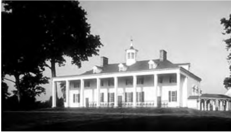
Mount Vernon circa 1855.