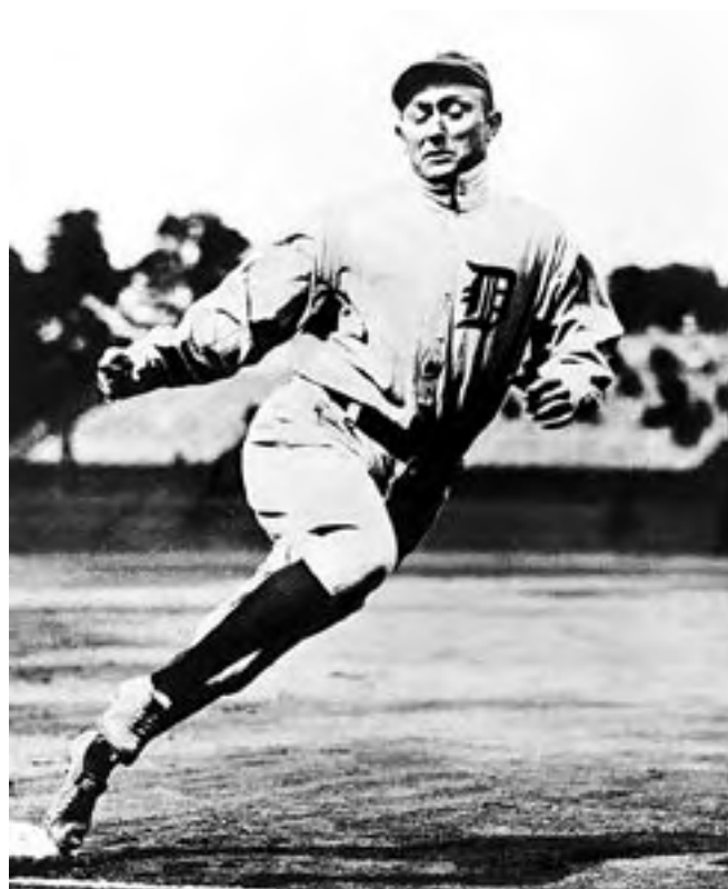
Native Georgian Ty Cobb is featured in the New Georgia Encyclopedia Online .