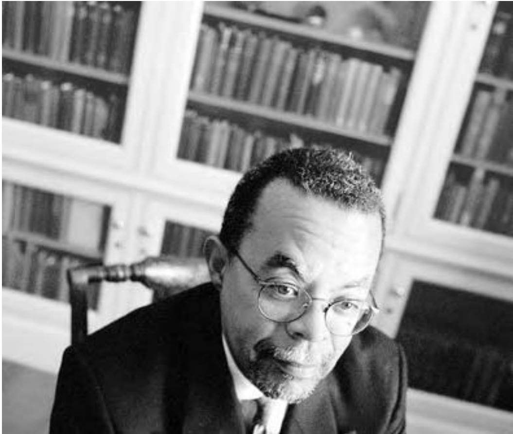
Henry Louis Gates Jr.