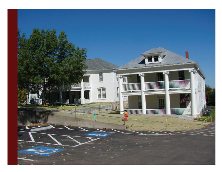
Photos: Left, Buildings 34, 76; Right, Building 76 hallway corridor after renovation