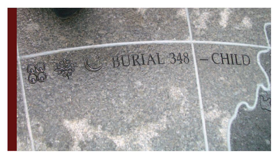
From left, inscription on the memorial; vaults being lowered into the ground