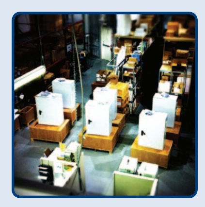
CellAntenna jamming equipment.

financing options. TPCC agencies involved in these types of trade shows have developed an Export Pavilion that serves as the U.S. Government's one-stop shop booth at many shows. The export finance agencies are also participating in select major international trade shows to provide the same help to U.S. exhibitors closing deals. During FY 2011, the three export financing agencies plan to provide counseling and training at more than 75 domestic International Buyer Program shows and international trade fairs.