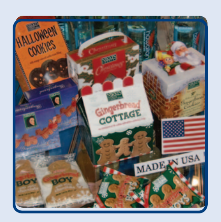
An assortment of products from Nikki's Cookies, a small Wisconsin firm that expanded exports to China.