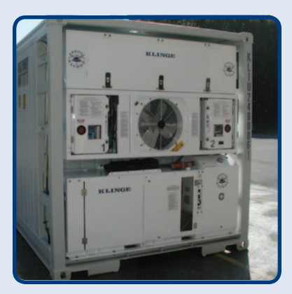
Klinge Corporation manufactures specialized transport refrigeration units and generator sets.

forums, or training and capacity-building efforts. The Program benefits from the active involvement of ITA trade officials stationed around the world as well as designated compliance officers in Beijing, Brussels, San Salvador, Tokyo, and now New Delhi. To assist in outreach to companies, ITA also maintains contact with the office of each member of Congress, some 60 DECs, more than 100 trade associations, and state agencies.