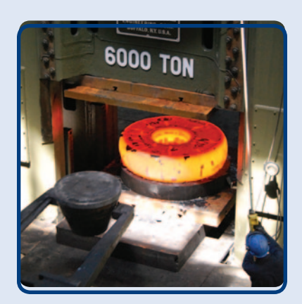
A forged spent nuclear fuel canister seal, being formed on one of the large presses at Custom Alloy Corporation.