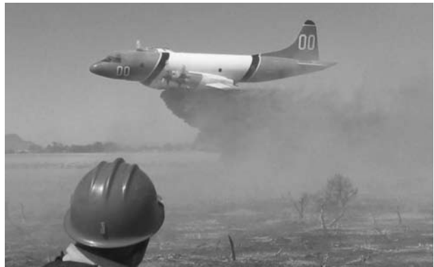
One of the remaining 19 airtankers FS has left under contract (down from 44 in 2002) that will be either too expensive to maintain or no longer airworthy by 2012. The aircraft is a P-3 and is over 45 years old.

Our audit found that FS' documentation to support acquiring critically needed new firefighting aircraft did not present the best case to justify buying new aircraft. FS' key airtanker fleet has an average age of 50 years. More than half of the 44 airtankers available under contract in 2004 were grounded for safety concerns, and by 2012 the remaining 19 airtankers will begin to be either too expensive to maintain or no longer airworthy. The availability of suitable aircraft has significantly changed over the years, likely making it necessary for FS to purchase the airtankers—at a cost of up to $2.5 billion—rather than lease them.