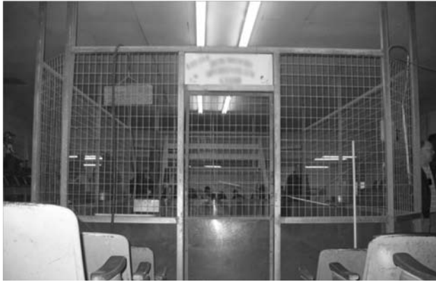
A caged ring where cockfights were held.

gambled on the outcomes of the fights. The then-sheriff of Page County accepted campaign contributions to protect the club from raids by law enforcement.