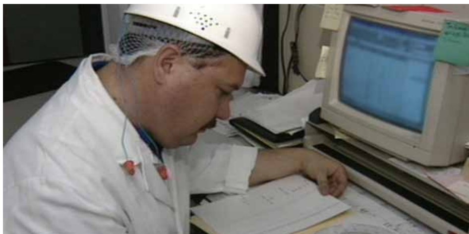
Plant inspector recording information at a computer station.