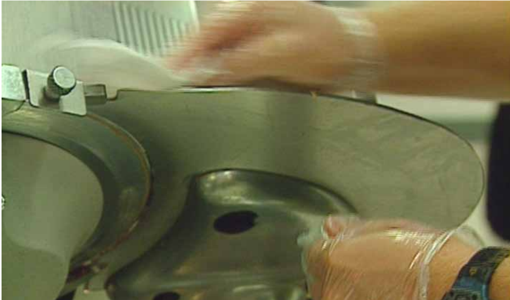
Plant employee cleaning a slicer.