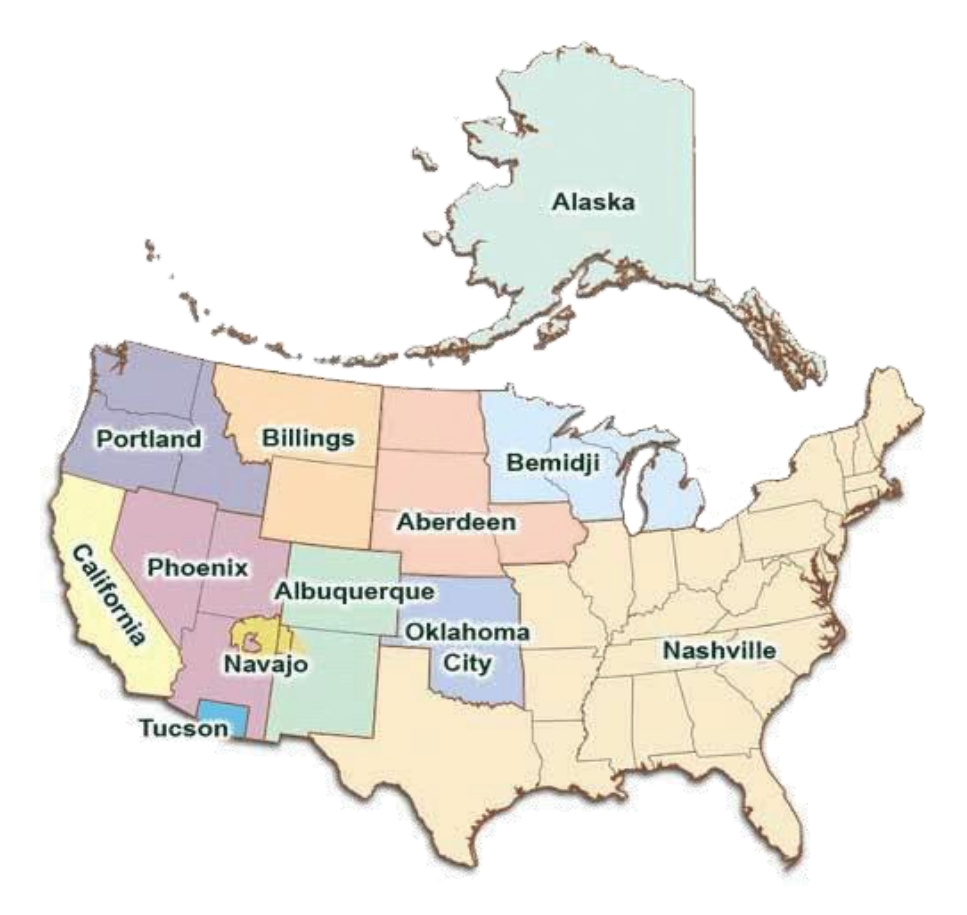
Figure 3. Map of IHS Areas

The IHS has a service population of approximately 2 million from 565 different Federally recognized Tribes and 34 urban Indian communities; about 1.5 million are considered IHS active users (i.e., persons who have received care in the most recent three-year period). The mission of the IHS is to raise the health status of the AI/AN people to the highest level possible. Efforts toward achieving this mission include the administration of direct healthcare services through a system of 12 Area Offices and 163 IHS and Tribally managed service units. A map of the IHS Areas is provided below. The pages that follow provide a profile of behavioral health services and resources in each Area, along with a program spotlight that details a featured behavioral health program.