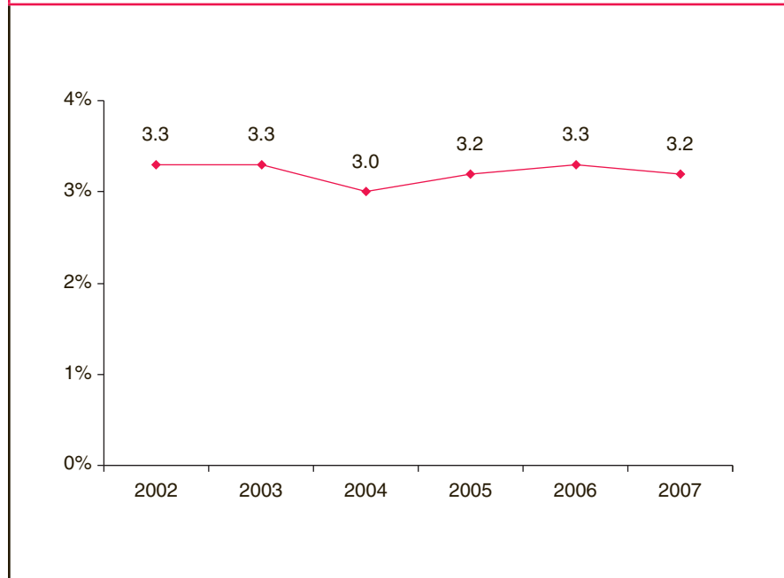
Figure 1. Percentages of Persons Aged 12 or Older Who Used Smokeless Tobacco in the Past Month: 2002 to 2007

Among persons aged 12 or older, the rate of recent initiation of smokeless tobacco use (i.e., first-time use of smokeless tobacco in the 12 months before the survey interview among all persons who had not previously used it) showed a modest, but statistically significant