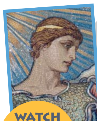
Minerva's feet as you walk around. They always point towards you!