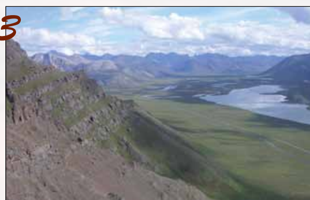
1, Icebergs immediately offshore from Ilulissat, Greenland; 2, Snowy peaks and muddy tidal flats of Cook Inlet, south of Anchorage, Alaska; and 3, Valley of the Atigun River with the Trans-Alaska Pipeline near Galbraith, Alaska.