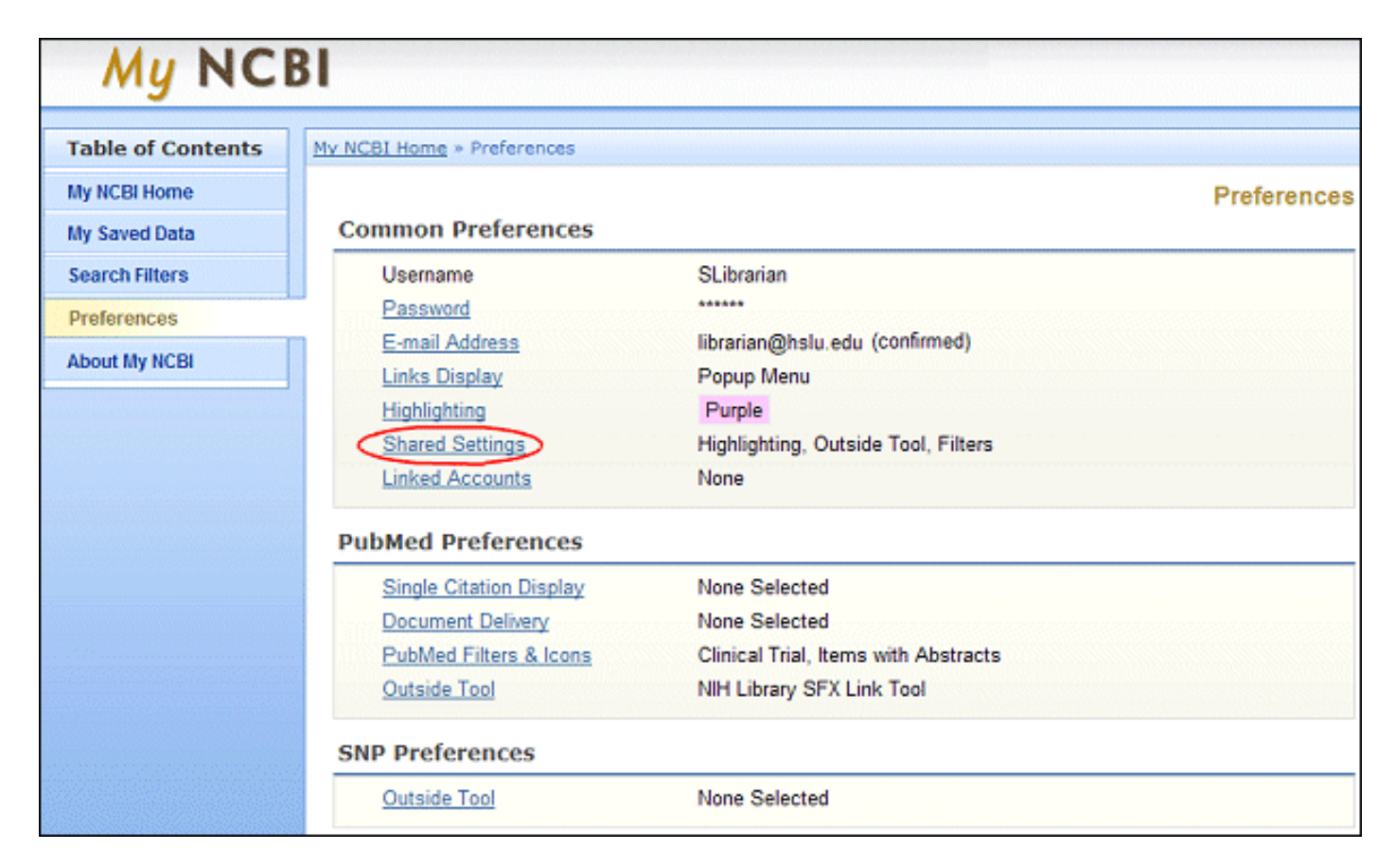
Figure 1: New Shared Settings option under My NCBI Preferences.

The new Shared Settings page has check boxes for each feature that can be shared. Users can easily select which settings to share by clicking the appropriate box (see Figure 2). Only those settings for a feature where the box is checked will be shared.