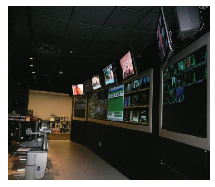
Figure 1. On the wall are fiber-optic fed video monitors in the VHO–Barco branded and 42-inch LCD displays.