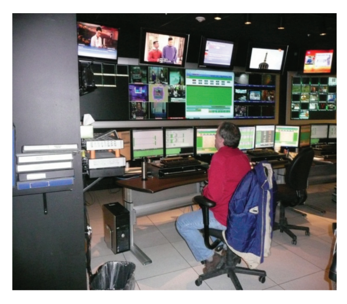
Figure 2. Employee surveying the fiber-optic fed video wall monitors (channel scan) and "thumbnail widgets" (split screens) on Barco branded screens in the VHO.

VHO employees typically sat in the first row of workstations closest to the wall monitors in the VHO area. This set-up facilitated access to the set top cable boxes for calibrating the remote control to the display monitor.