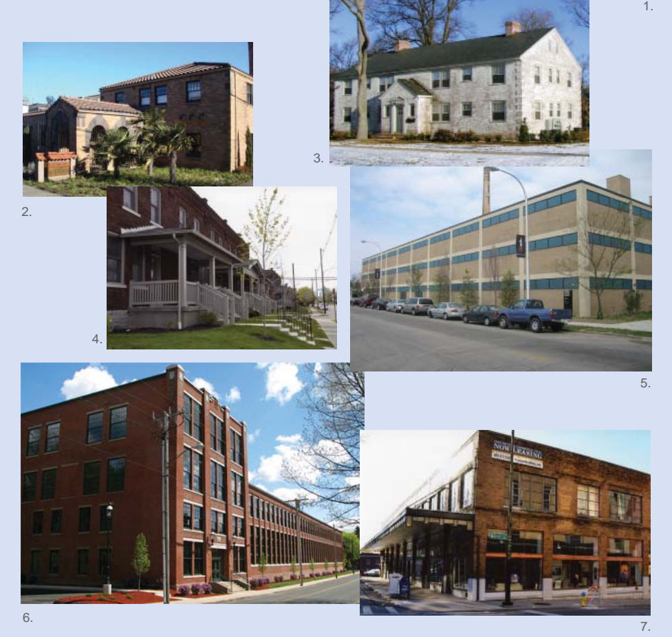
Walker Bank Building, Salt Lake City, UT; 2. Hennessey Funeral Home, Portland, OR; 3. Kent Road Village, Richmond, VA; New Indianola Historic District, Columbus, Ohio; 5. Chemistry Research Building, Chicago IL; 6. Cheney Mill Yarn Dye House, Manchester, CT; 7. Daylight Apartments, Knoxville, TN.

Investing in historic structures in older neighborhoods, providing local jobs, and stimulating neighborhood revitalization are all signature features of the Federal Historic Preservation Tax Incentives program. An essential financial tool for historic building rehabilitation, the Federal tax incentives help preserve historic structures of every period, size, style, and type. Abandoned or underutilized schools, warehouses, factories, churches, retail stores, apartments, hotels, houses, agricultural buildings, and offices throughout the country have been given new life in a manner that maintains their historic character. In FY 2011, 69% of the rehabilitation programs provided housing, including 7,470 affordable housing units. Commercial and office accounted for the second and third most common new uses.