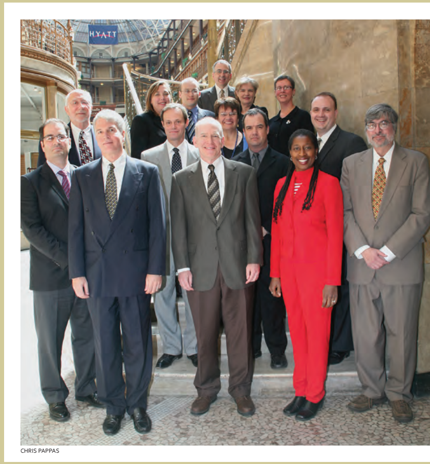
Legal experts, academics, and government officials presented research, practitioner

In addition, products that pose serious potential danger to consumers must have regulatory approval before they go on the market. That is how it works with the processed food and pharmaceuticals overseen by the Food and Drug Administration (FDA), which has partial or full veto power over new product releases.