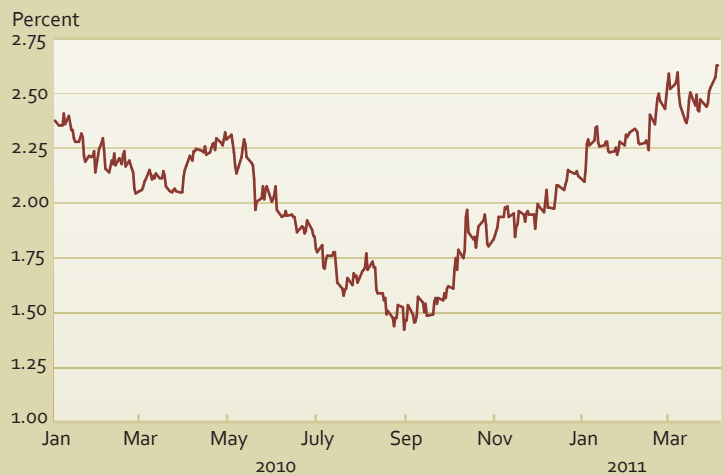
Note: Calculated using inflation swaps.