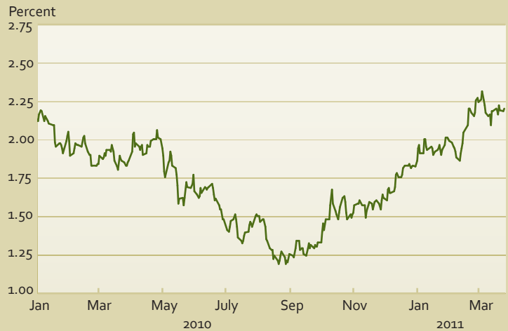
Note: Calculated using TIPS break-even inflation rates.