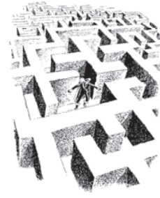
An image from the 1966 book Gobbledygook Has Gotta Go .

COMPLEXITY AND POMPOSITTY -- MOSTLY COMPLEXITY