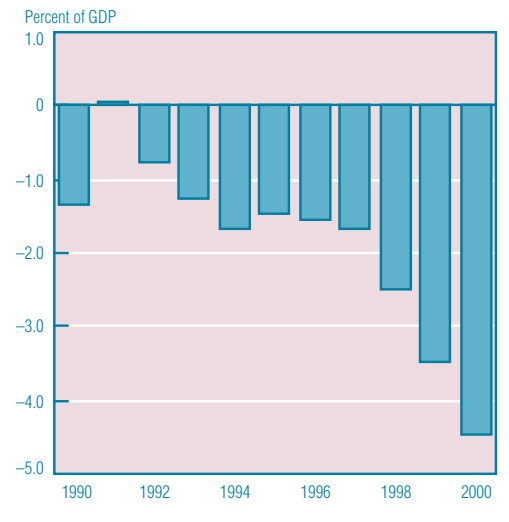
FIGURE 4 TRADE BALANCE