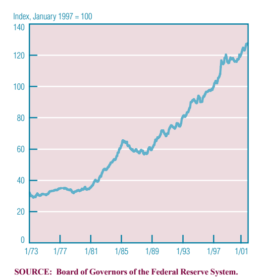
FIGURE 2 REAL DOLLAR EXCHANGE RATE INDEX