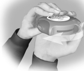
273 274 Figure 6

268 4. Close the DISKUS when you are finished taking a dose so that the DISKUS will be ready for 269 you to take your next dose. Put your thumb on the thumbgrip and slide the thumbgrip back 270 towards you as far as it will go ( see Figure 6 ). The DISKUS will click shut. The lever will 271 automatically return to its original position. The DISKUS is now ready for you to take your 272 next scheduled dose, due in about 12 hours. (Repeat steps 1 to 4.)