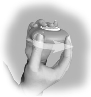
236 237 Figure 2

233 Hold the DISKUS in one hand and put the thumb of your other hand on the thumbgrip . Push 234 your thumb away from you as far as it will go until the mouthpiece appears and snaps into 235 position ( see Figure 2 ).