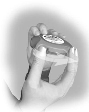
242 243 Figure 3

239 Hold the DISKUS in a level, flat position with the mouthpiece towards you. Slide the lever 240 away from you as far as it will go until it clicks ( see Figure 3 ). The DISKUS is now ready to 241 use.