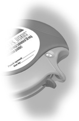
229 230 Figure 1

231 Taking a dose from the DISKUS requires the following 3 simple steps: Open, Click, Inhale.